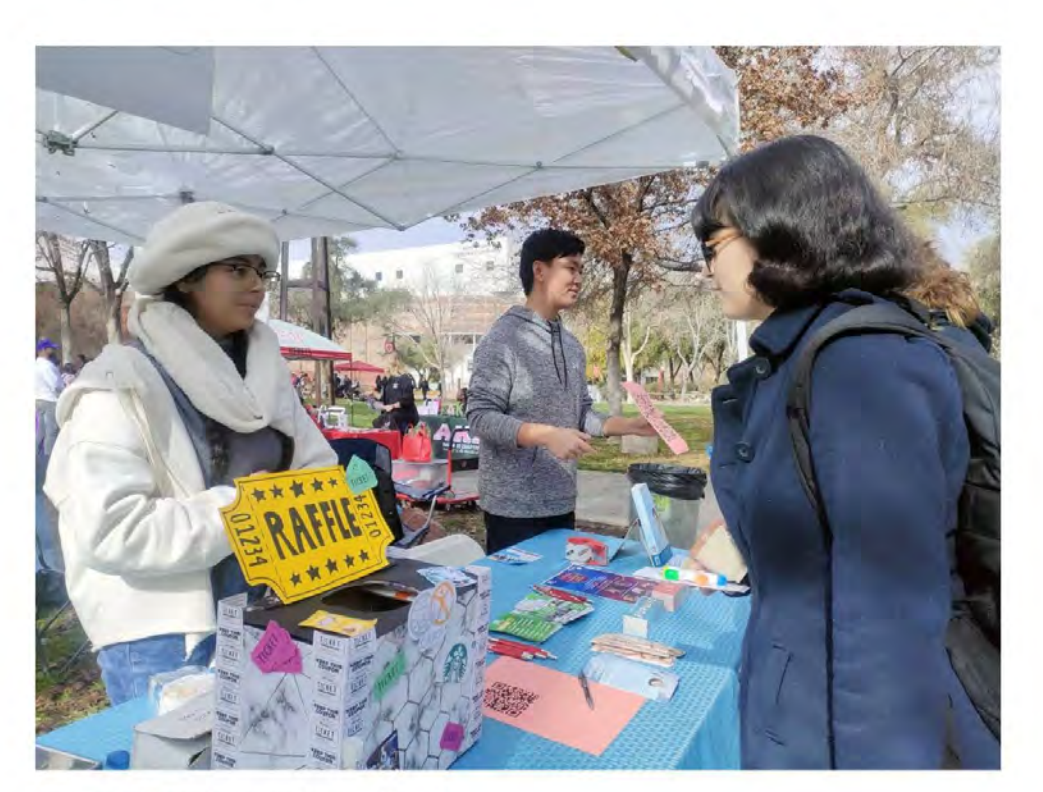
University of Nevada, Las Vegas; Las Vegas, NV