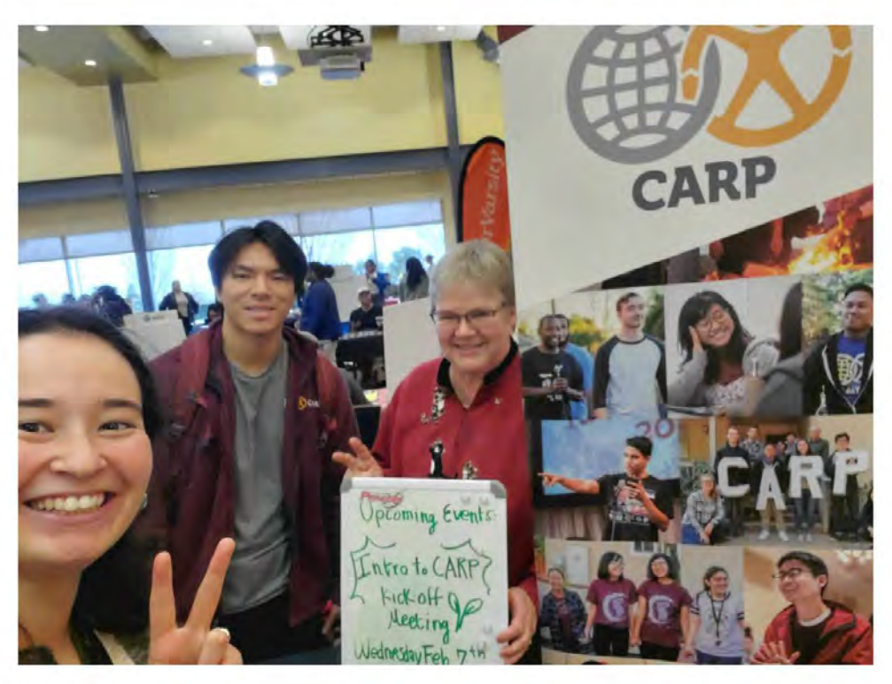
Chabot College; Hayward, CA