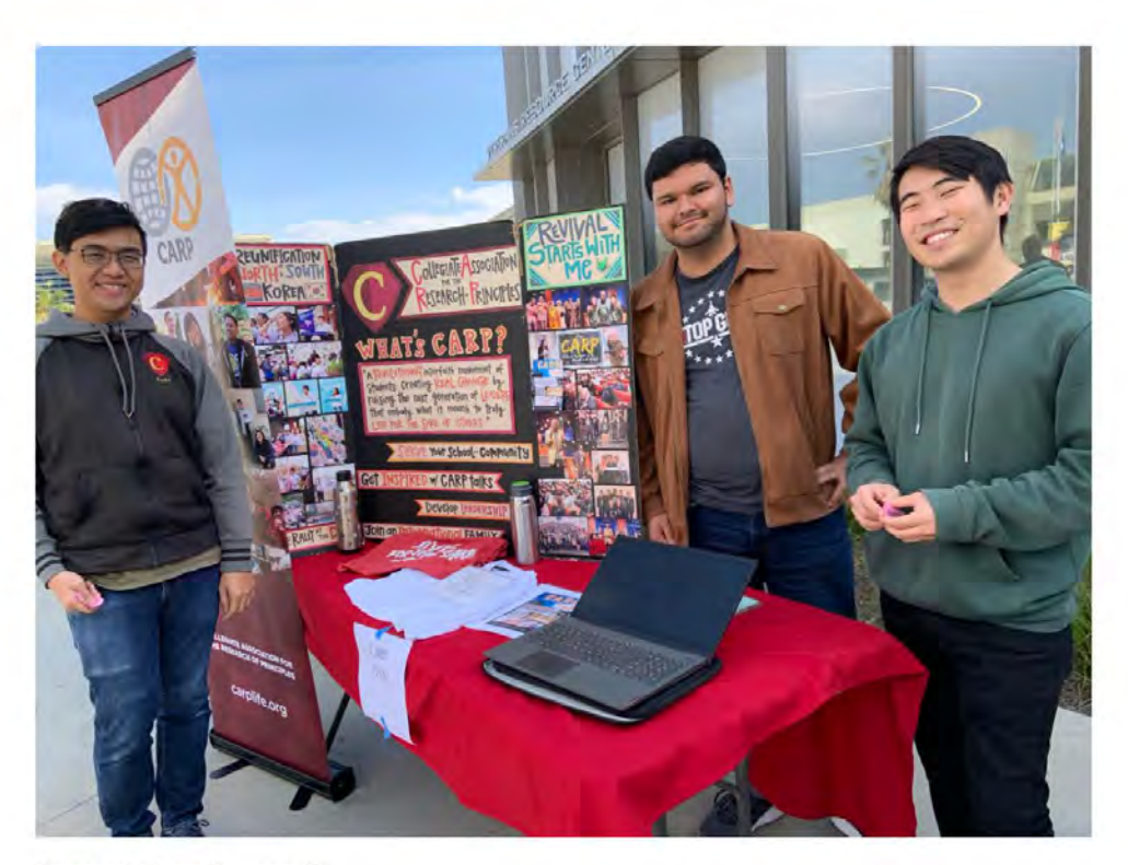
Cypress College; Cypress, CA