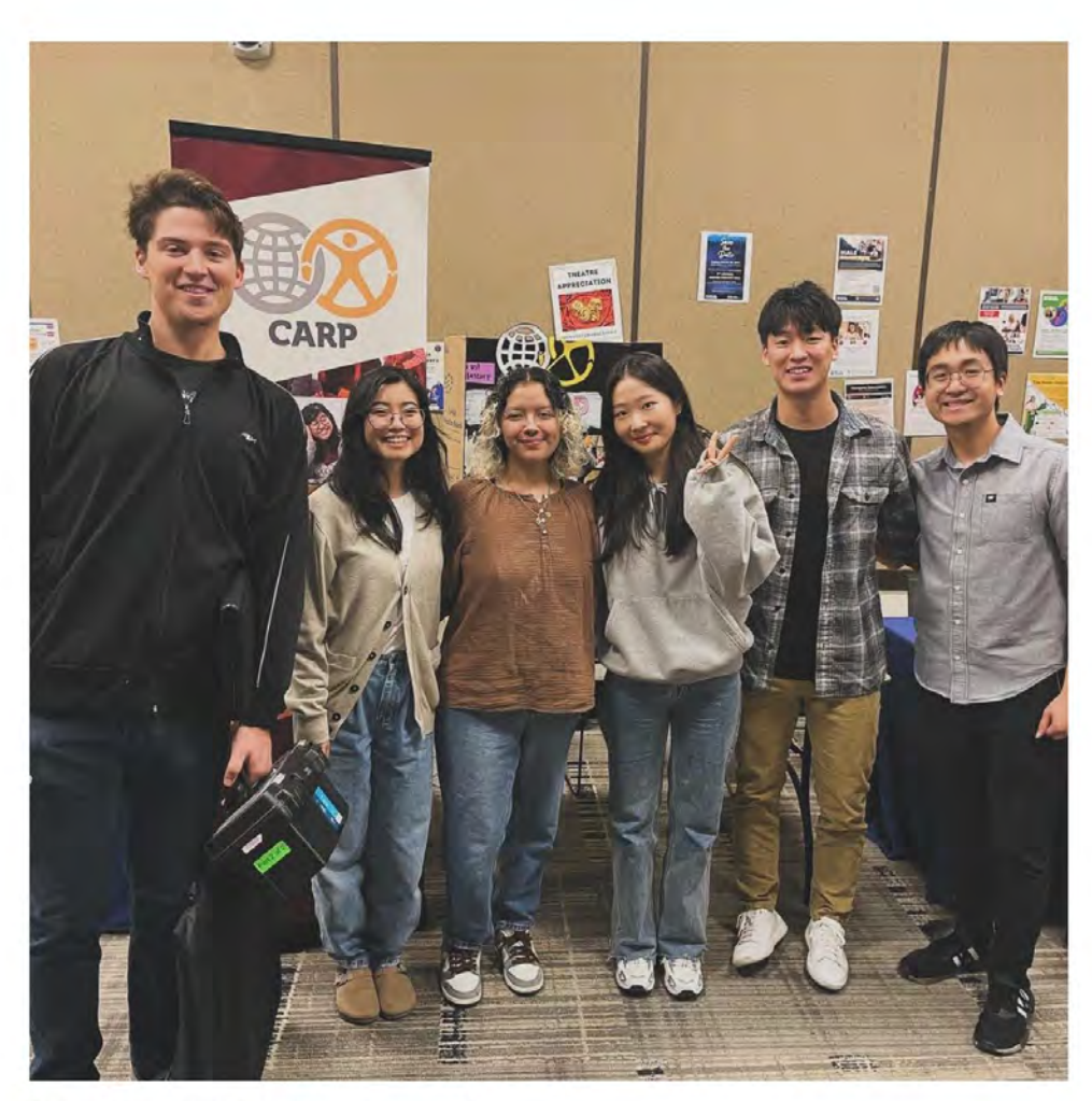
Dallas College, North Lake Campus; Irving, TX