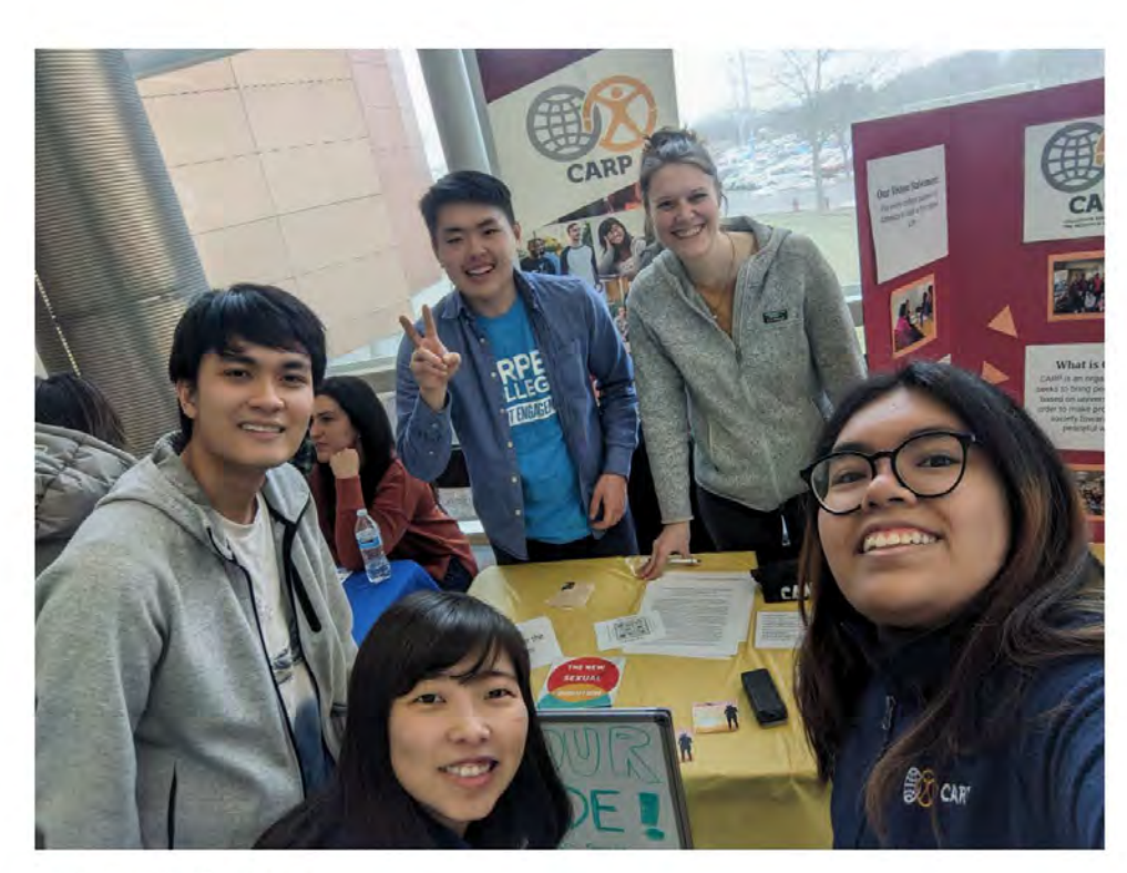
Harper College; Palatine, IL