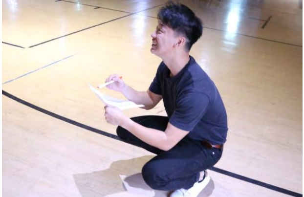
After dinner, there was a reflective activity where participants were given an opportunity to reflect on their challenges and write an anonymous letter to God, and then respond anonymously to someone else's letter. Many people were able to gain deep insights and hope to overcome struggles they were facing.