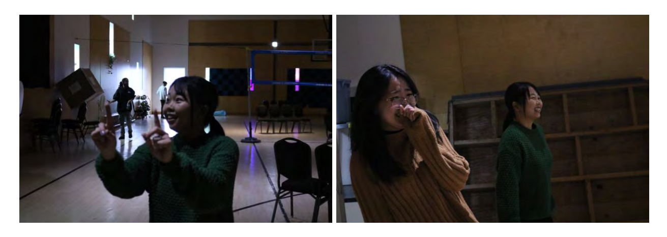
"Every point he mentioned was something I needed to hear."

The retreat began on Friday the 15th with some fun, energetic activities, followed by two lectures on the Divine Principle given by CARP leaders. After each lecture, participants engaged in lively discussion in their teams.