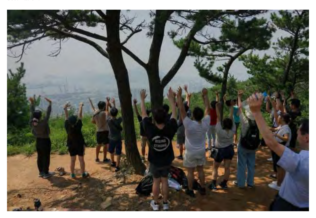
Day 3 Testimonies:

"Through praying at the Rock of Tears and climbing the mountain to the holy ground, I was able to feel the devotion that Father Moon put each day."