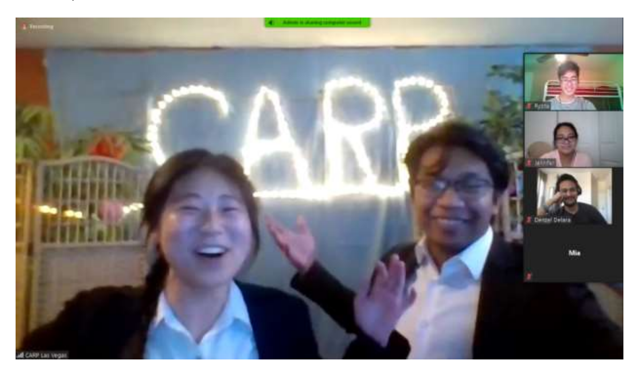
Dear CARP Family,

Since its founding in January 1966, the Collegiate Association for the Research of Principles has led the charge in promoting a new worldview based on the Divine Principle to college students. With the establishment of CARP at Columbia University in 1973, that effort took root in America, and has flourished over the past 50 years. The National Collegiate Association for the Research of Principles Inc. (NCARP) was founded in 1980 to support the growth of the CARP movement in America. In its 43 year history, NCARP has undertaken many significant providential initiatives, such as combatting Marxism, advocating for Pure Love, and presenting a "Headwing" approach to cultural issues through the <a href="Principled Worldview Curriculum">Principled Worldview Curriculum</a>. These efforts resulted in broader cultural impact on the college campuses, centered on the Divine Principle worldview.