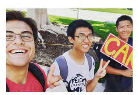
California California State University, Long Beach