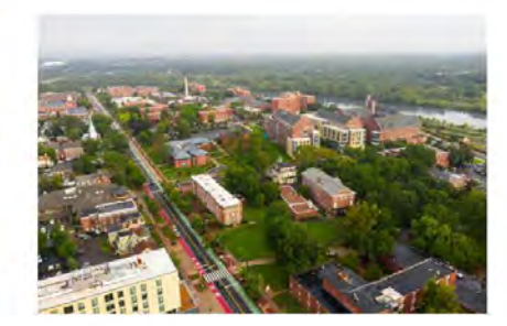
New Jersey Rutgers-New Brunswick