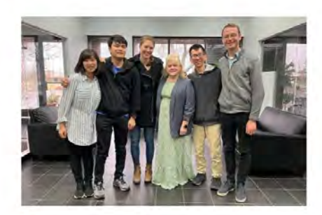
Illinois Harper College