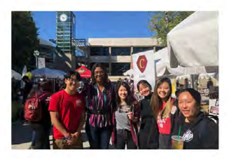
California Pasadena Community College (PCC)