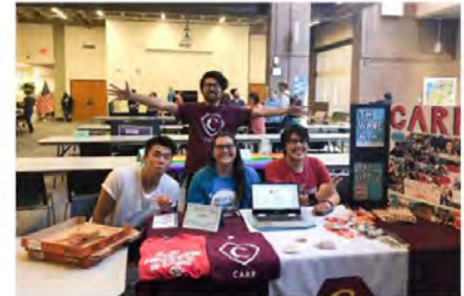
Texas Dallas College, North Lake Campus