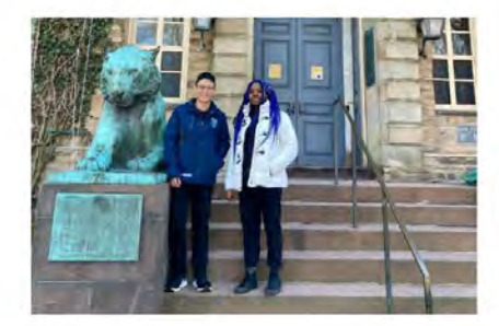
New Jersey Princeton University