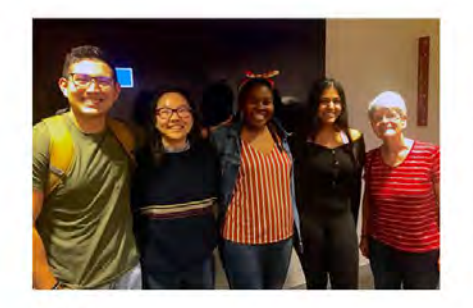
Arizona Arizona State University