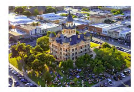
Texas University of North Texas