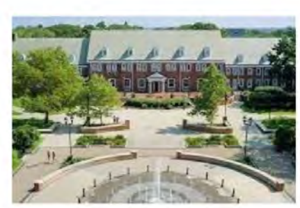
New York Farmingdale State University