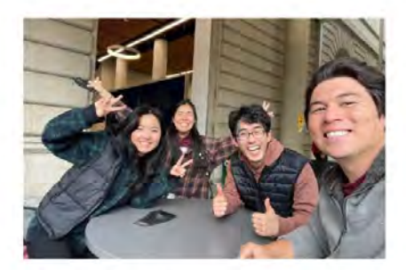
Pennsylvania Community College of Philadelphia