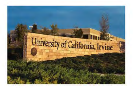
California University of California, Irvine