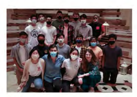
Maryland Montgomery College