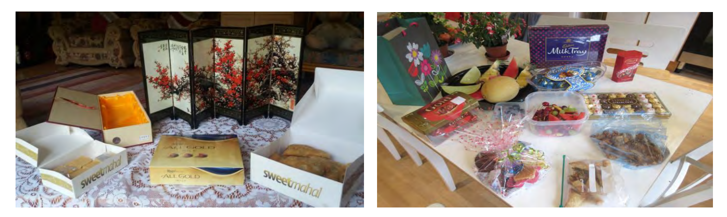
Somosas, various sweets and a beautiful screen.

For a number of years now, we have visited as many of our Muslim friends as possible, to pay our respects and to bring some food which they can use to break their fast at the evening meal (Iftar), anything from home-made soup to fruit, scones and lemon cakes. It is inevitably a wonderful, joyful experience of mutual respect, and quite often we return home with as many gifts from our friends as we set out with to visit them. Many times we will hear them quote that " Allah will give even more blessing to those who feed the ones who are fasting".