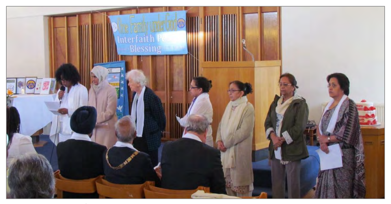
Prayers from the Christian, Muslim, Jewish, Sikh, Hindu and Zoroastrian traditions