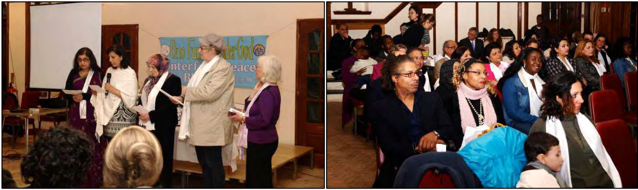
L to r: Hindu, Sikh, Muslim, Christian and Bahai prayers. - Even towards the back of the room, all felt part of the occasion.