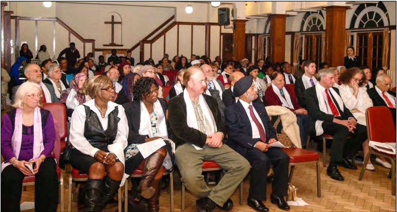
The Bahai, Christian, Sikh, Muslim, Hindu, and Jain traditions were all represented.