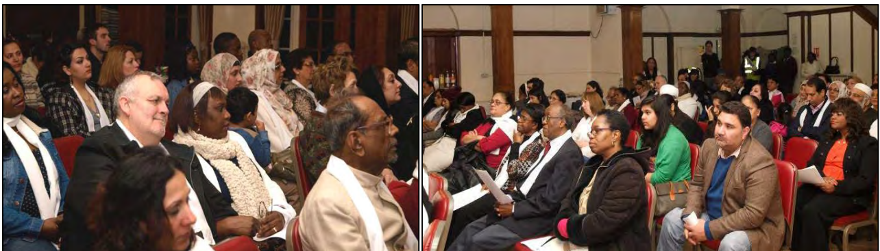
Many countries of Africa, Asia and Europe were represented among the 140 or so people present.