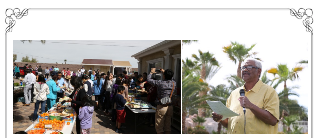
Easter Celebration on March 27