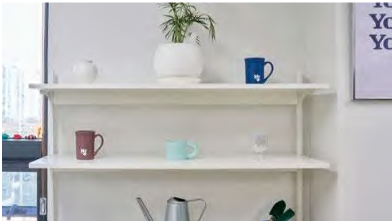
Interior decoration by the young people

When the church officially opened last December, meaningful changes began to appear among the Youths themselves. As they joined in shaping the church's operations and direction, a natural sense of responsibility and ownership took root. By debating budgets and designing programs firsthand, their perspective on the church shifted dramatically. Where once they had been mere participants, they had now become co-creators - owners actively building the community together. This transformation is regarded as the most significant change of all.