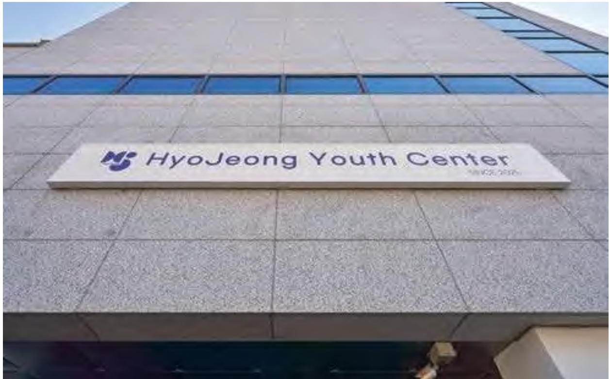
Hyojeong Youth Center sign, home to Hyojeong Youth Church

The church also includes gathering rooms where youth can freely meet for conversation and activities, as well as a rehearsal studio for the youth band to practice. Together, these spaces reflect a deliberate vision: to make the church not merely a place of worship, but a living environment that naturally integrates with the rhythm of young people's everyday lives.