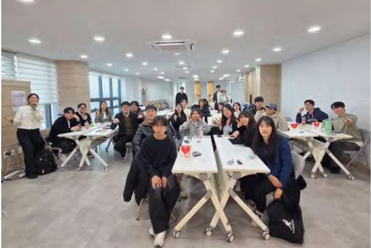
Worship service at Hyojeong Youth Church

On December 21, 2025, Hyojeong Youth Church officially opened its doors as the young persons' hub church of Northern Gyeonggi District, with a dedication service. The church represents a new model of faith community - one that goes beyond the conventional role of a young person or student ministry within an established congregation. Here, young people are not simply participants; they take primary responsibility for the church's ministry and operations, leading the community together. They are involved not only in Youth programs but also in key areas such as finances and administration.