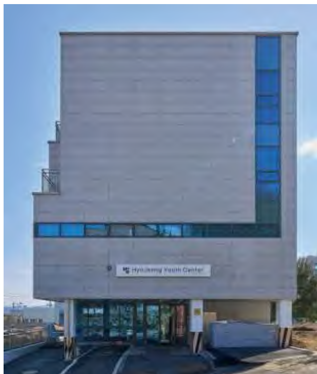
Hyojeong Youth Center, the home of Hyojeong Youth Church

Through this process of reflection, the dream and vision of a "Youth Church" gradually took root. At the same time, the vibrant community of members in their 20s and 30s at Guri Grand Church offered precisely the strong youth foundation that such a vision required. As these elements converged, a bold new challenge was set in motion: the establishment of a young generation hub church.