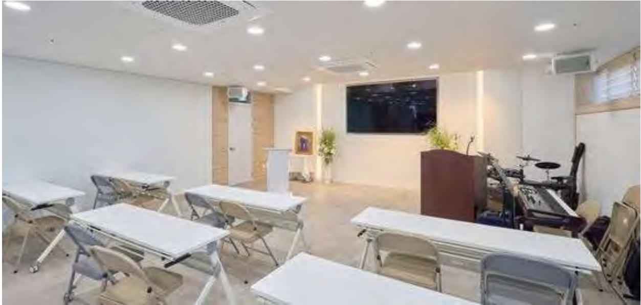
Hyojeong Youth Church chapel

Rather than simply asking them to come, we need to become a community that gives them a genuine reason to want to be here." In a world of increasingly busy lives and rapidly shifting values, young people's ways of engaging with the world are constantly evolving. In this light, Hyojeong Youth Church is committed to being a community that offers young people meaningful encounters and experiences that truly matter.