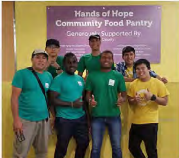
August 17, 2019 @ Catholic Charities of Southern Nevada with International Leadership Training Program (ILTP)