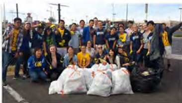
April 25, 2014 @ El Pollo Loco