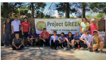
April 27, 2019 @ Pittman Wash