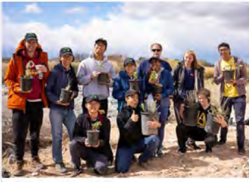
March 2, 2019 @ Las Vegas Wash