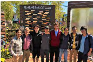
March 9, 2019 @ Las Vegas Community Healing Garden