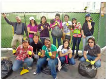
Our First Service Project (March 16, 2013 @ World's Largest Gift Shop)