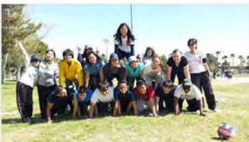
Shine City Project's 1st Anniversary (March 15, 2014 @ Sunset Park)