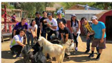
April 20, 2019 @ Gilcrease Nature Sanctuary