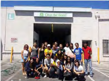
July 25, 2015 @ Clean the World