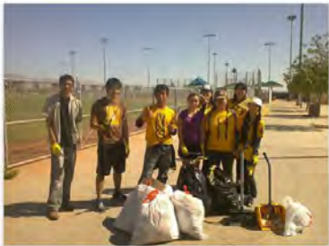
April 26, 2013 @ Lorenzi Park