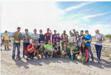
October 13, 2018 @ Las Vegas Wash with Generation Peace Academy