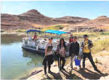
October 20, 2018 @ 33 Hole Overlook, Lake Mead