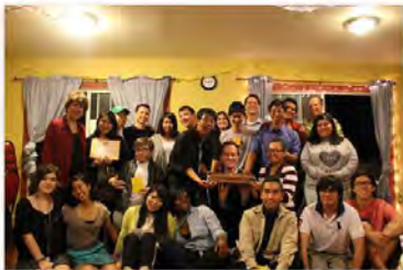
Shine City Project's 2nd Anniversary Celebration (March 14, 2015)