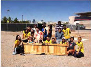
August 9, 2014 @ Rebel Recycling Center