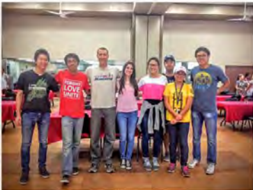
July 31, 2015 @ Las Vegas Rescue Mission