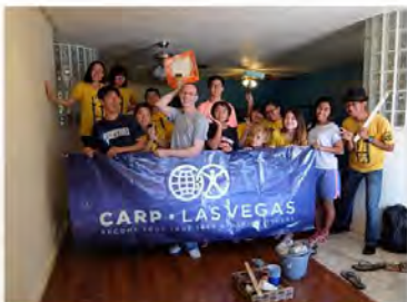
August 22, 2014 @ CARP Las Vegas House