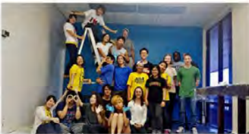
August 16, 2014 @ CARP Las Vegas Learning Center