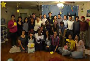
Shine City Project's 3rd Anniversary Celebration (March 18, 2016)