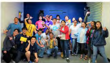
Shine City Project's 6th Anniversary Celebration (March 16, 2019 @ CARP Las Vegas Learning Center)