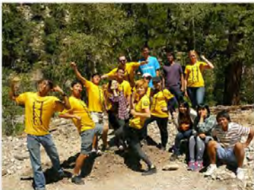
August 15, 2014 @ Mt. Charleston