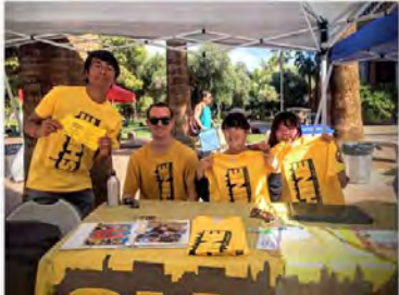
September 2, 2015 @ UNLV Involvement Fair