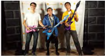
October 30, 2015 @ Haunted Harvest, Springs Preserve