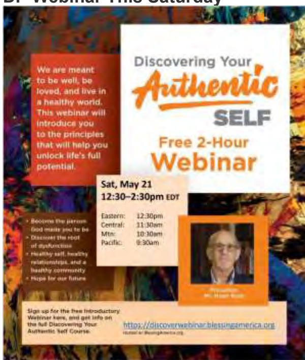
Sign up at discoverwebinar.blessingamerica,org