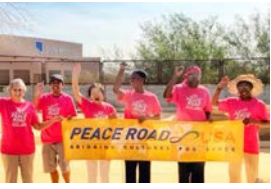
1 LAS VEGAS SPRINGS PRESERVE