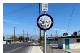
6 MCWILLIAMS TOWNSITE