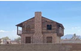
3 BINION HOUSE