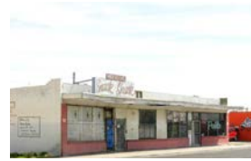
9 JACKSON STREET COMMERCIAL DISTRICT