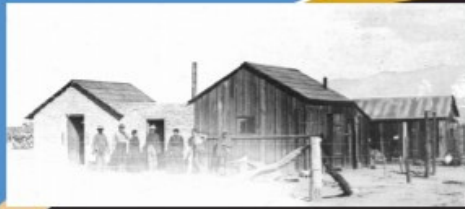
McWilliams townsite 1904

The Pioneer Trail is the vision of the West Las Vegas community that wanted to celebrate the history of West Las Vegas and the early pioneers that settled the area and contributed to its culture and heritage. A community group was formed to interview long-time residents and research the history of the area. The result was an extensive oral history collection and access to photographic archives that wove a tale of dreams realized and lost, civil rights victories, speakeasies and the development of a strong community, ethnically diverse and culturally rich.