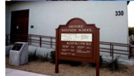
12 WESTSIDE SCHOOL