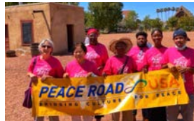
15 LAS VEGAS MORMON FORT