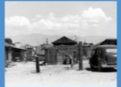
Marroe Avenue 1943

The Pioneer Trail leads visitors through the area where the development of early Las Vegas truly began. As you travel from site to site, you will gain a sense of the adventurous spirit of those men and women who contributed to the growth and cultural heritage of the valley. And you will leave with an understanding of the extreme difficulties of making a life in this once-barren desert.