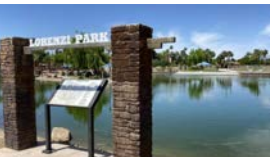
2 LORENZI PARK