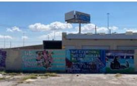
5 MOULIN ROUGE