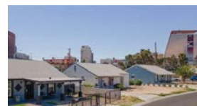
16 BILTMORE VILLAGE