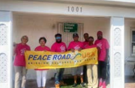
8 HARRISON HOUSE