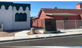
7 ST. JAMES THE APOSTLE CATHOLIC CHURCH