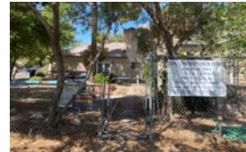
10 CHRISTENSEN HOUSE "THE CASTLE"