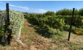
4 KIM PRODUCE FARM