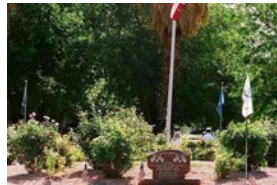
14 WOODLAWN CEMETARY