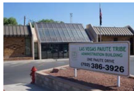
13 LAS VEGAS PAIUTE COLONY