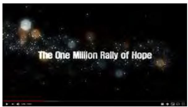
▲ 10 minute promotion video for Rally of Hope Nov. 21 sizzle(LVFC version)