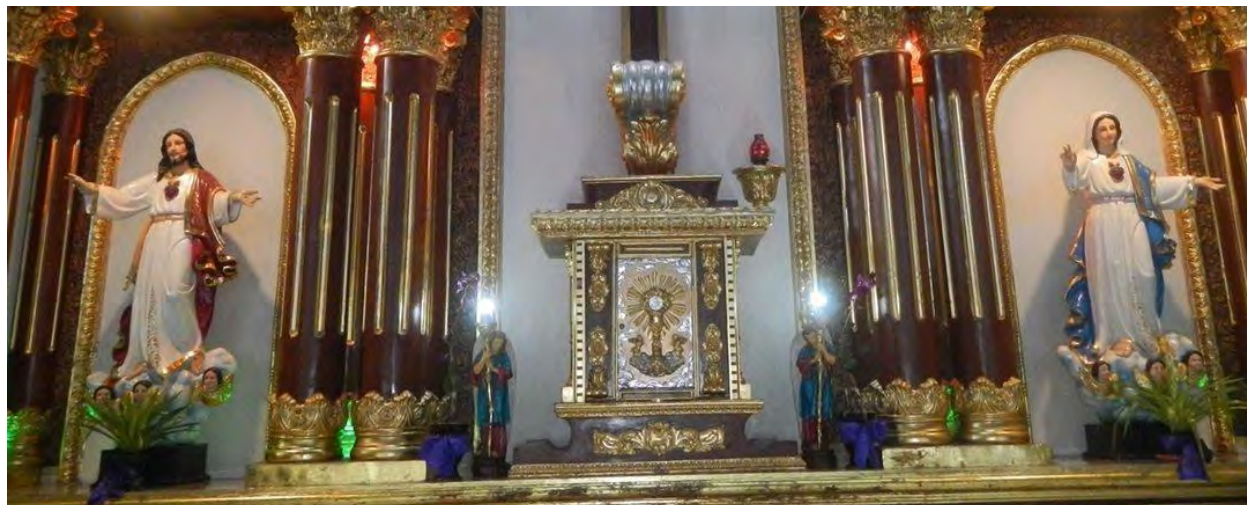
The Hearts of Jesus and Mary Parish Church (USAFFE Road, Veterans Village, Holy Spirit, Quezon City, Philippines) Roman Catholic Diocese of Novaliches List of barangays of Metro Manila, Legislative districts of Quezon City District II, Barangays of Quezon City Holy Spirit