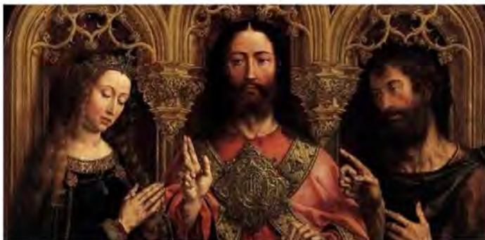
Christ between Mary and John the Baptist. Public domain image

Experienced lecturers delve into the failure of key persons to support him and find him a bride