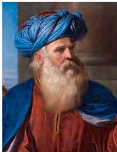
Portrait of Abraham, detail of a painting by Guercino (1657), Pinacoteca di Brera, Milan, Italy. Photo: Octave 444 / Wikimedia Commons. License: CC ASA 4.0 Int

But as you know, Abraham, in the process of coming into that position, did not succeed in achieving what God actually wanted.