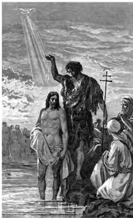
John the Baptist baptizes Jesus. Author: Gustave Doré (1832-1883). Public domain image. Cropped

I think all of you are familiar with the story of the baptism of Jesus by John, when a dove appeared and announced directly to John the Baptist who the person in front of him was. And you can understand John's struggle later. After an initial enthusiasm about that, he began to evaluate who Jesus was, from a more humanistic perspective.