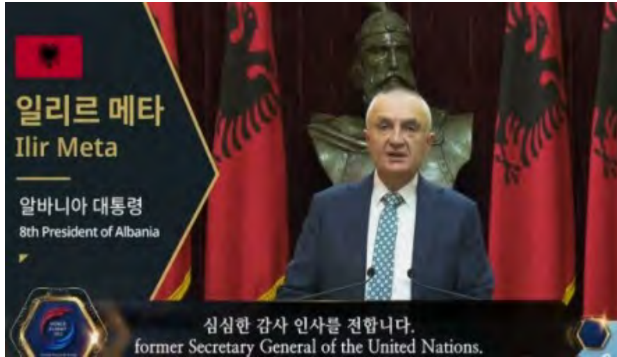
President Ilir Meta, Albania