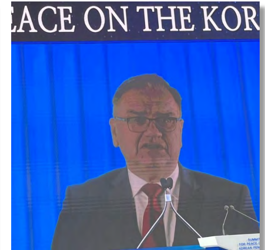
Former Pres. Ivanic of B&H