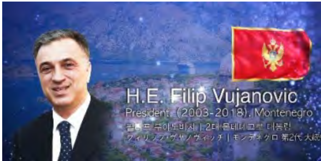
Former President Filip Vujanovic, Montenegro