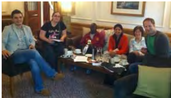
A new environment, a new experience