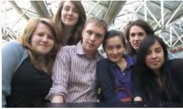
At Starbucks in Paddington