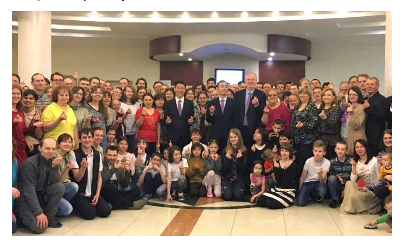
My CARP motto includes the content, "Advance Father's plan." This means that CARP should do things before receiving any direction, and do even more than True Parents expect.

After that, Mother took me to a department store and bought two summer suits; one was meant for me and one for Father. Except for the size, they were identical. I knew this was an expression of Mother's love, not for just me but symbolically for all our members.