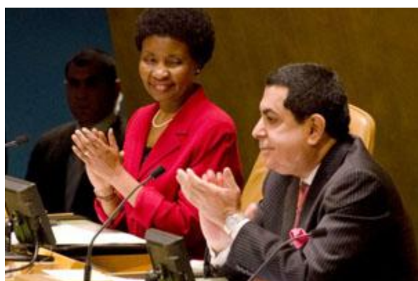
General Assembly President H.E. Mr. Nassir Abdulaziz Al-Nasser and Deputy Secretary-General Asha-Rose Migiro