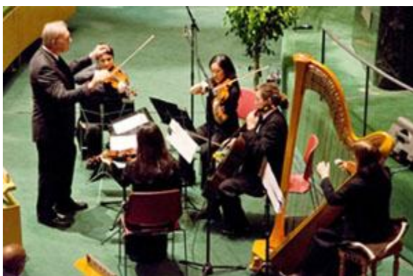
New York City Symphony Chamber Ensemble

Following this, the delegates turned to the contributions that religions could make to advancing four key areas of focus identified by the President of the General Assembly: Mediation of Conflict, Disaster Prevention and Response, Revitalization of the United Nations, and Sustainable Development.