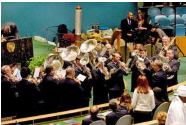
The Salvation Army New York Staff Band

“What we have achieved here today is significant,” said President Al-Nasser in his concluding remarks. “Let each of us assume the task of interfaith harmony as our personal responsibility, for as was so clearly demonstrated here today the fruits of religious dialogue and understanding offer the hope of a new era of peace for all humanity.”