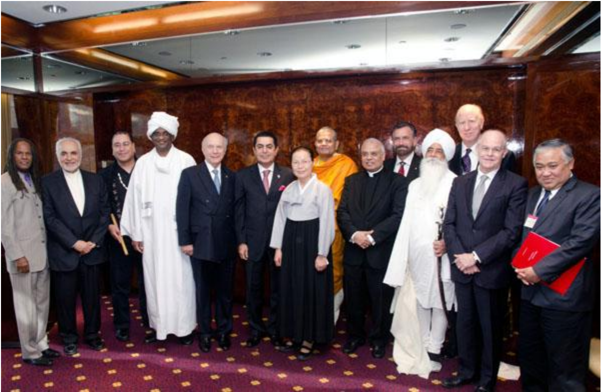
Some of the religious leaders and program speakers with General Assembly President Nassir Al-Nasser at a post-event luncheon