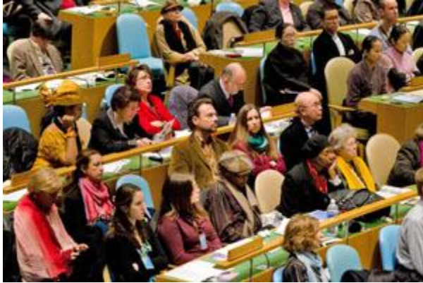
The audience listens attentively