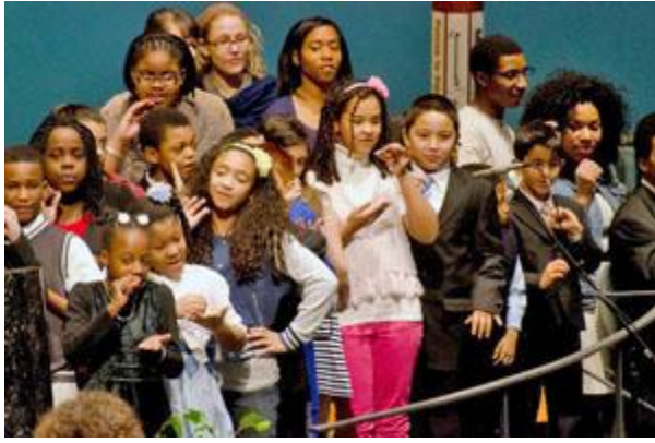
The Children's Theater Company