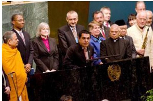
General Assembly President H.E. Mr. Nassir Abdulaziz Al-Nasser with interfaith speakers

Deputy Secretary-General Asha-Rose Migiro urged the interfaith community to speak out against extremism, advance tolerance, and stand firm for social justice, dignity, and mutual understanding. “Although faith is the glue that often bonds communities and cultures around the world, it is too often used as an excuse to emphasize differences and deepen divisions,” she said. “Only by finding common cause in mutual respect for shared spiritual and moral values can we hope for harmony among nations and peoples.”