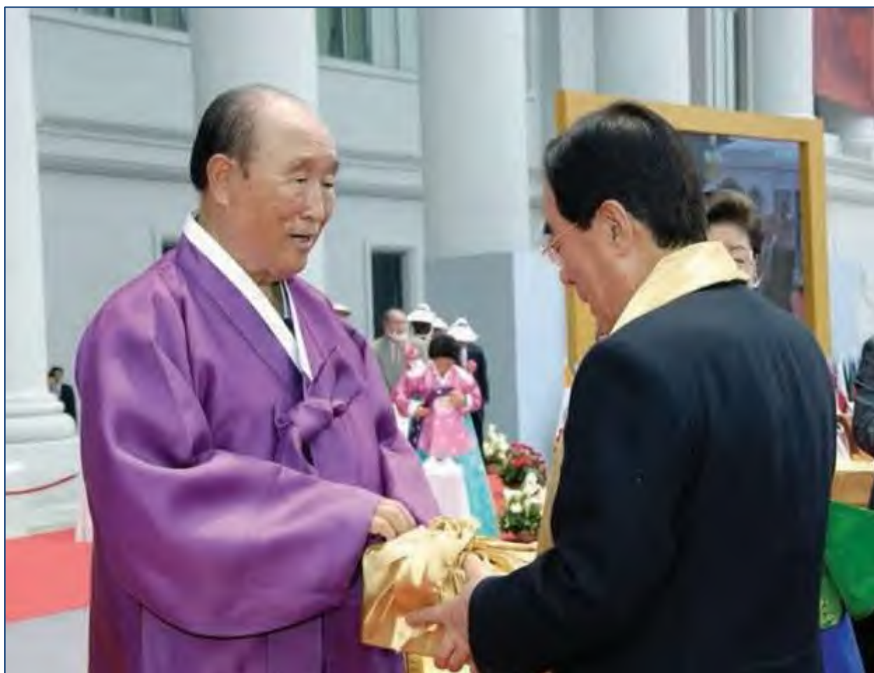
Father Moon giving the holy scripture Cheon Seong Gyeong to a Korean clan leader on June 13, 2006

Father Moon also emphasized the spiritual dimension of the ceremony on 13th June 2006, claiming that great multitudes of spirits also descended to witness the event.