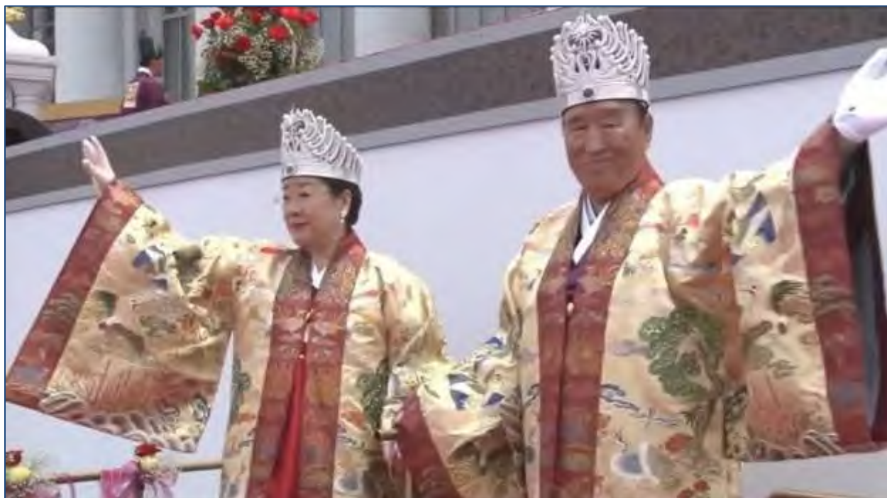
The True Parents in stately robes at the entrance ceremony of the Cheon Jeong Temple on June 13, 2026

The temple was presented not merely as a museum or headquarters but as the first permanent dwelling place for God here in the physical world, based on the foundation established by the True Parents . The building was understood as a symbolic and providential center uniting heaven and earth, East and West, and the spiritual and physical worlds.