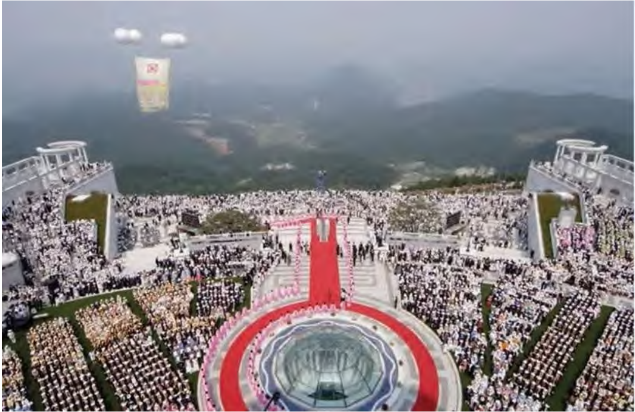
From the grand inauguration ceremony of the Cheon Jeong Temple on June 13, 2026

Also related to inauguration of sacred site: The Kingdom of Heaven