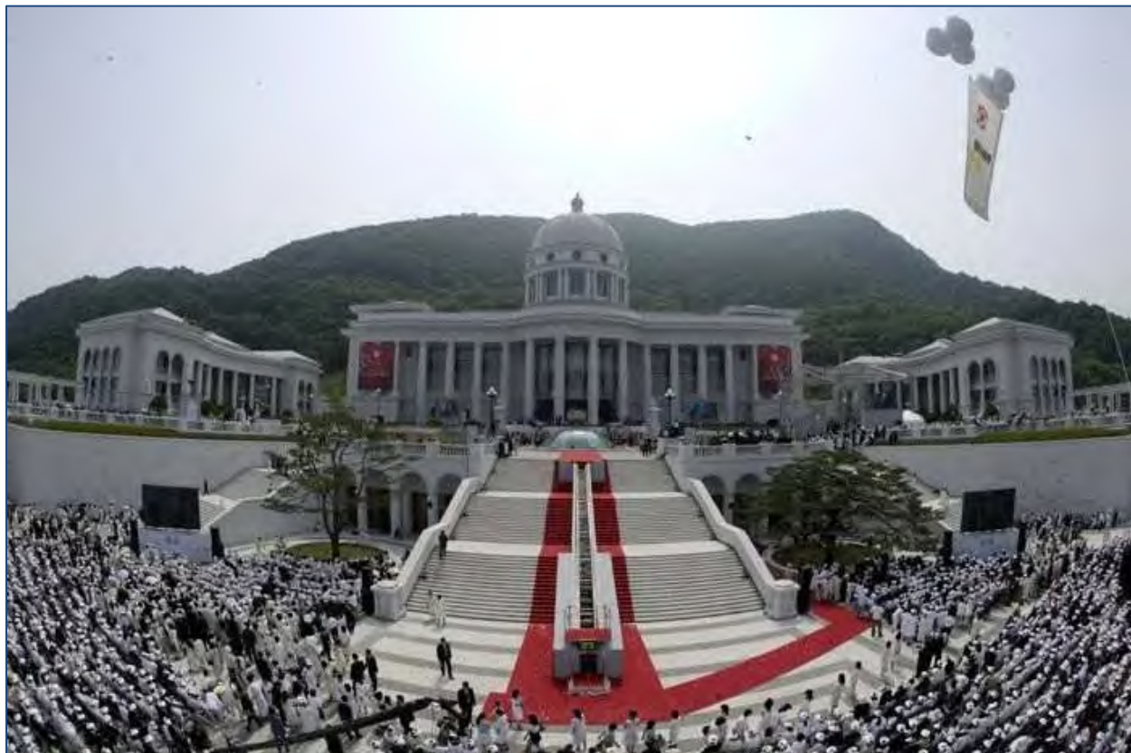
From the grand inauguration ceremony of the Cheon Jeong Temple on June 13, 2026

According to Father Moon , the completion of this sanctuary symbolically reversed the historical failures of the Garden of Eden, transitioning humanity into the "Age after the Coming of Heaven", which had been declared in May 2005. The opening ceremony also represented liberating God's heart from all the sorrow the Creator had suffered throughout the long course of humanity's history.