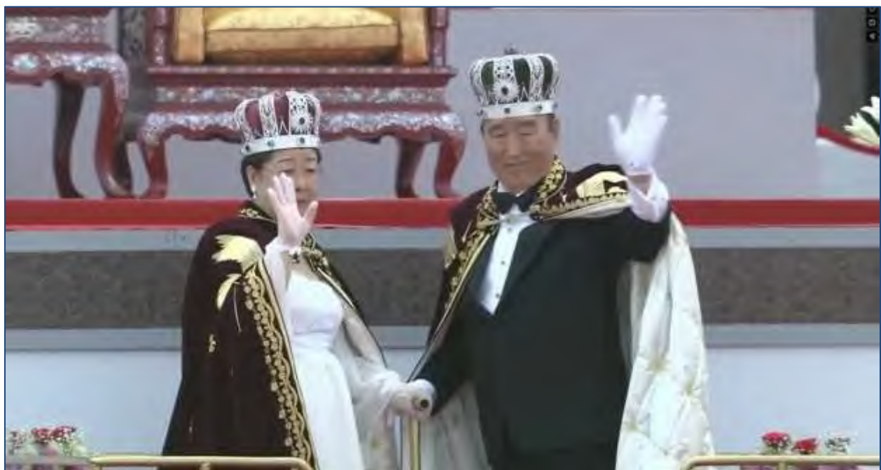
The True Parents with special robes and crowns at the inauguration ceremony of the Cheon Jeong Temple on June 13, 2026

Still more, related to inauguration of sacred site: The 3 Great Blessings: God's Divine Plan