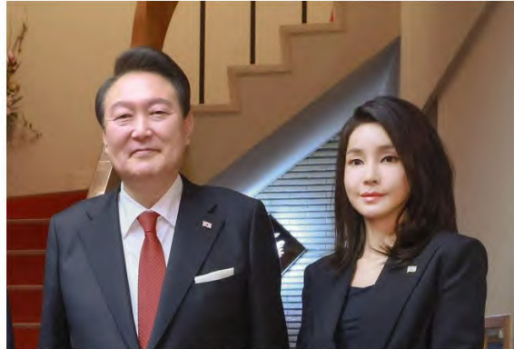
He was given life sentence, she 4 years in what some perceive as revenge on political opponents: Former South Korean President Yoon Suk-yeol and First Lady Kim Keon-hee, here in Tokyo 16th March 2023.

After the oath had been completed, Mother Han asked the presiding judge for permission to make a brief statement. Once allowed to speak, she