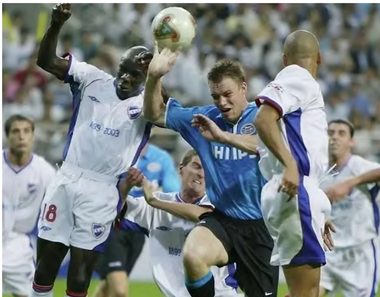
From the first Peace Cup in 2003, the match between Dutch club PSV Eindhoven and Nacional of Uruguay 18th July 2003

The column also highlights what Jeong regards as the positive contributions made by the Tongil Group (통일그룹) [See editor's note below] and related organizations through sport. Beyond competitive success, Seongnam Ilhwa is credited with helping develop players, attracting spectators, and enhancing Korea's international football profile.