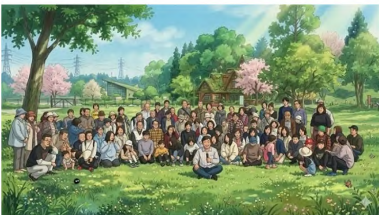
The state took their places of worship. Must hold worship services in parks. Here, An illustration of members gathering in a Japanese park for their Sunday meeting 12th April 2026.

Although the chairman had instructed them to “maintain dignity as religious