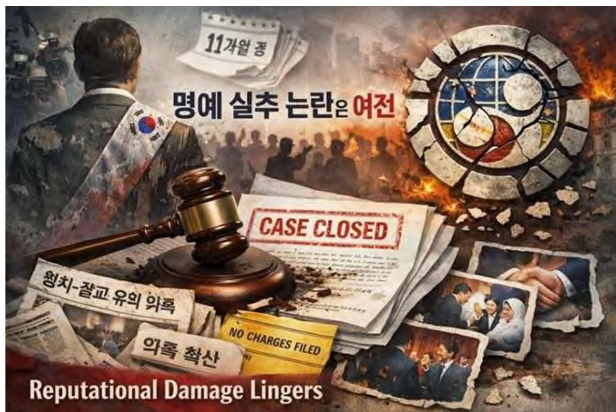
Featured image above: Collusion narrative unravels as probe closes. Illustration: ChatGPT