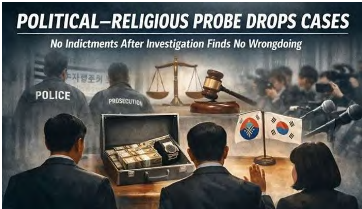
Alleged Unificationism influence case collapses. Illustration: ChatGPT

Yet, according to the investigators, the central problem with the case was the lack of solid evidence. While there were testimonies suggesting that money had changed hands, these statements were largely indirect. In other words, they were based on what people had heard rather than what they had directly witnessed. Crucially, there was no clear, verifiable proof showing who gave money to whom, when it happened, how much was involved, or under what circumstances the transactions took place.