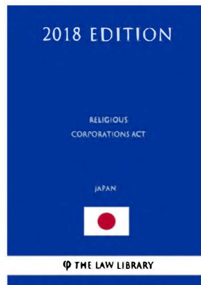
Front page of 2018 English version of Religious Corporations Act of Japan.

See also Shocked Author: “Japan Ignores Basics of