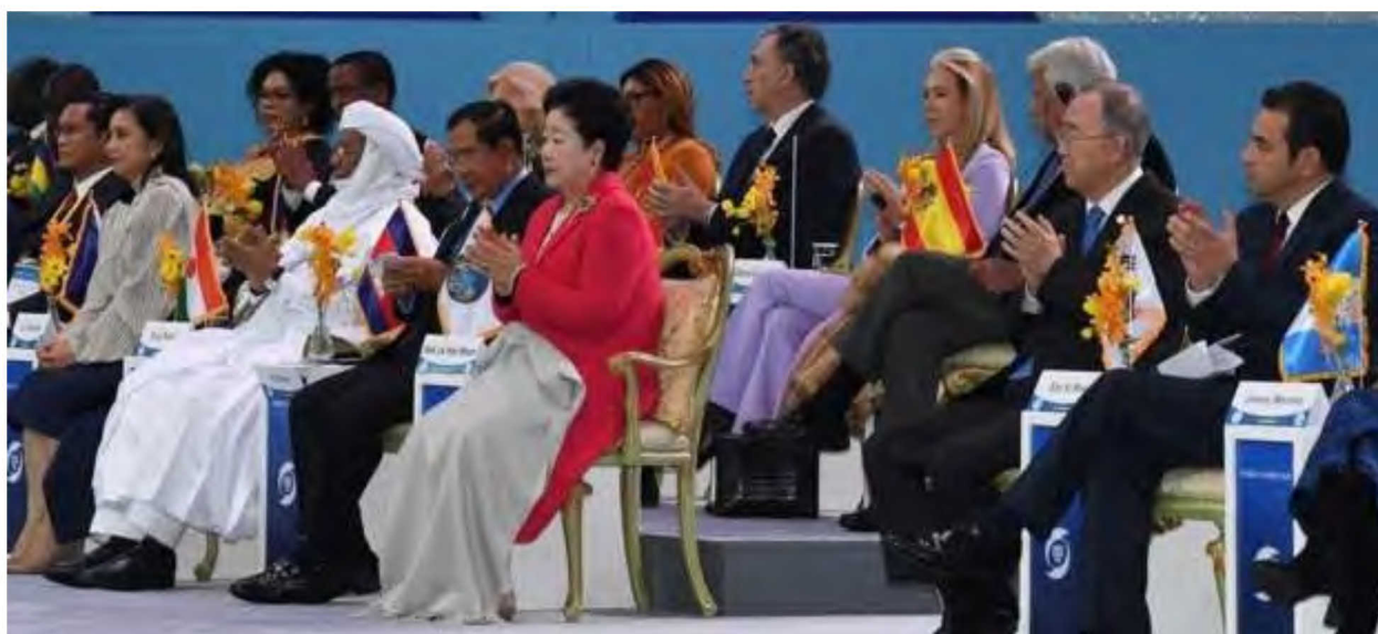
Mother Han (in red) with heads of state and world leaders on February 4, 2020, at the World Summit 2020, a large international peace conference in South Korea

To contextualize this nomination, it is useful to understand how the Nobel Peace Prize process operates. Unlike many awards, nominations are not open to the general public. Eligible nominators include members of national parliaments and governments, certain university professors (typically in fields such as history, social sciences, law, or theology), previous Nobel laureates, and members of international courts. Qualified individuals may submit nominations to the Norwegian Nobel Committee, the body responsible for selecting the Peace Prize laureate. Self-nominations are not permitted, and the full list of nominees remains confidential for 50 years.