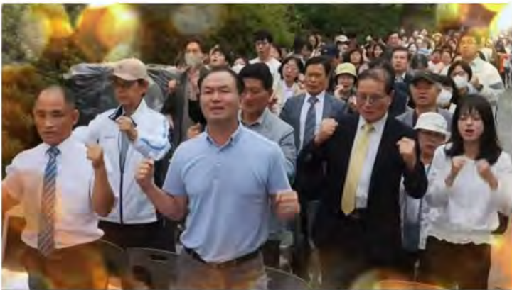
From a prayer meeting in support of Mother Han outside Seoul Detention Center, November 2025.

And the first stage will be to examine any previous written statements and authenticate any documents that are presented. Then in round two, there'll be questioning and cross examination.