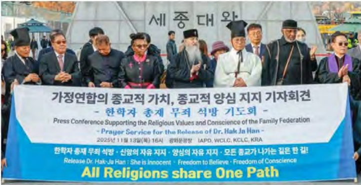
From a rally at King Sejong's Plaza in central Seoul 13th Nov. 2025 led by religious leaders from a wide variety of faiths in support of Mother Han.