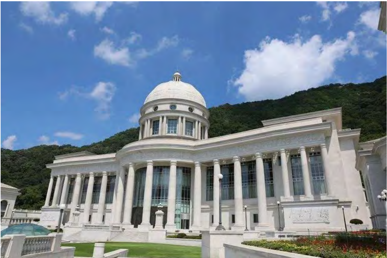
One of the sacred sites of the Family Federation - the Cheon Jeong Temple in Gapyeong, South Korea. The building houses a museum in honor of the life of the True Parents