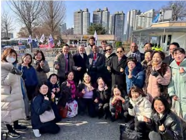
US clergy and Family Federation members from Los Angeles outside Seoul Detention Center 4th December 2025.

I have no interest in the politics of this nation. My entire life, instead, I have educated people while praying for world peace, for one human family, and for all people who attend our Heavenly Parent to become true families, receive Heavenly Parent's love, and ultimately go to heaven.