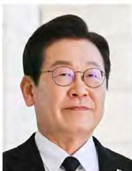
South Korean President Lee Jae-myung at Arlington National Cemetery, Arlington, Virginia, USA 26th Aug. 2025. Public domain image. Cropped

Please come to Gapyeong and see what I have done."