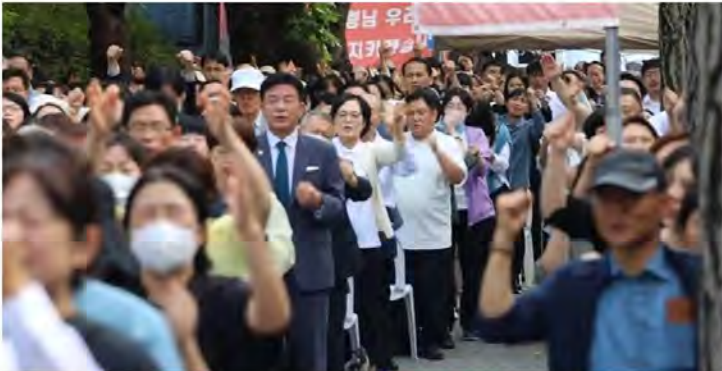
From a prayer meeting in support of Mother Han outside Seoul Detention Center, November 2025.

And the holidays are coming up, so frankly, a lot of prayer is still needed that this does not drive on and on and on.