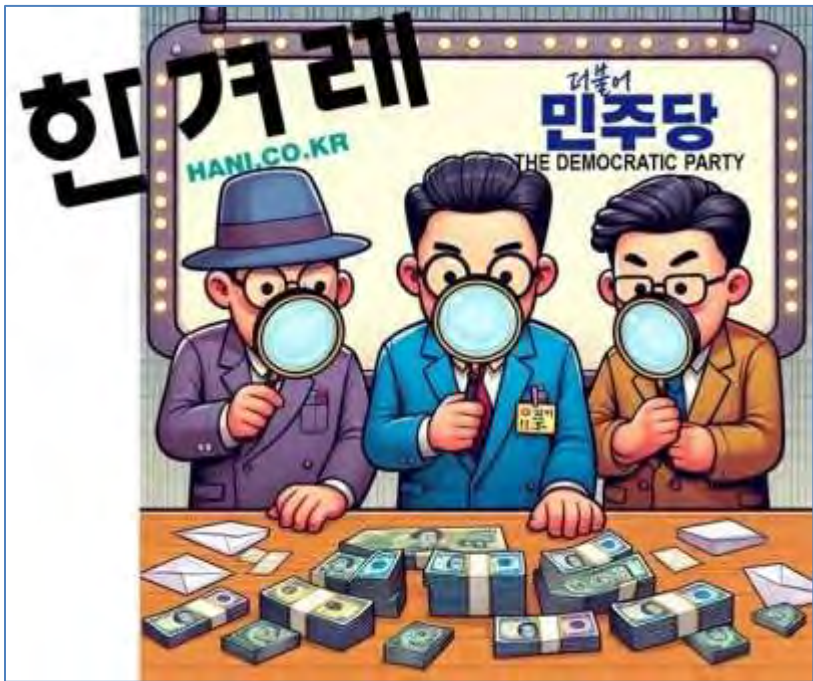
Hankyoreh journalists at work. Illustration: Microsoft Designer Image Creator, with added logos