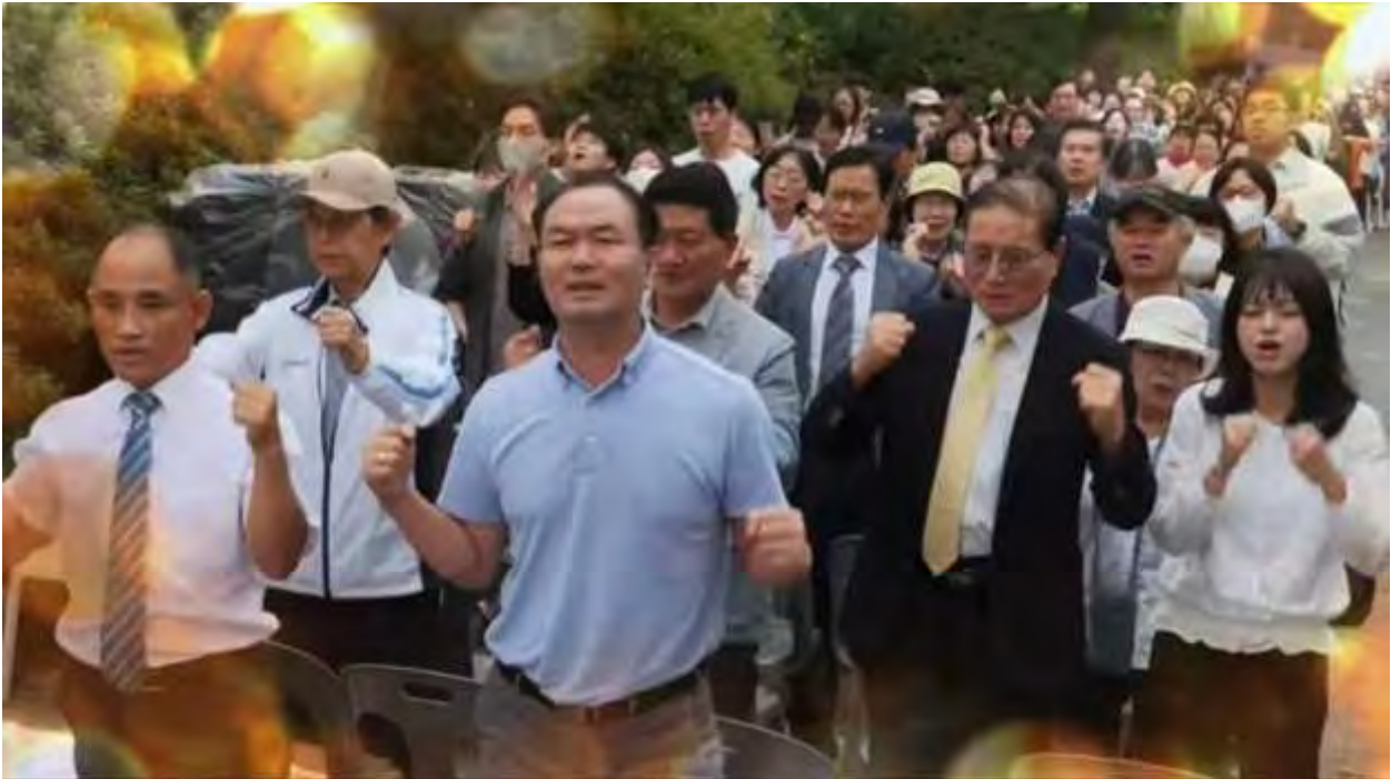
From a prayer meeting in support of Mother Han outside Seoul Detention Center, November 2025

"You must specify exactly allegations that you dispute. It's not enough to give a general response. You need to be specific, and you need to indicate whether you are disputing the electronic evidence or whether you admit that these contents are authentic."