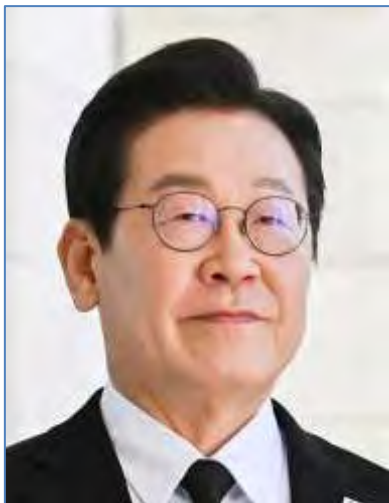
South Korean President Lee Jae-myung at Arlington National Cemetery, Arlington, Virginia, USA Aug. 26, 2025

Many high level figures sincerely hope that this trial will be conducted according to proper democratic principles.