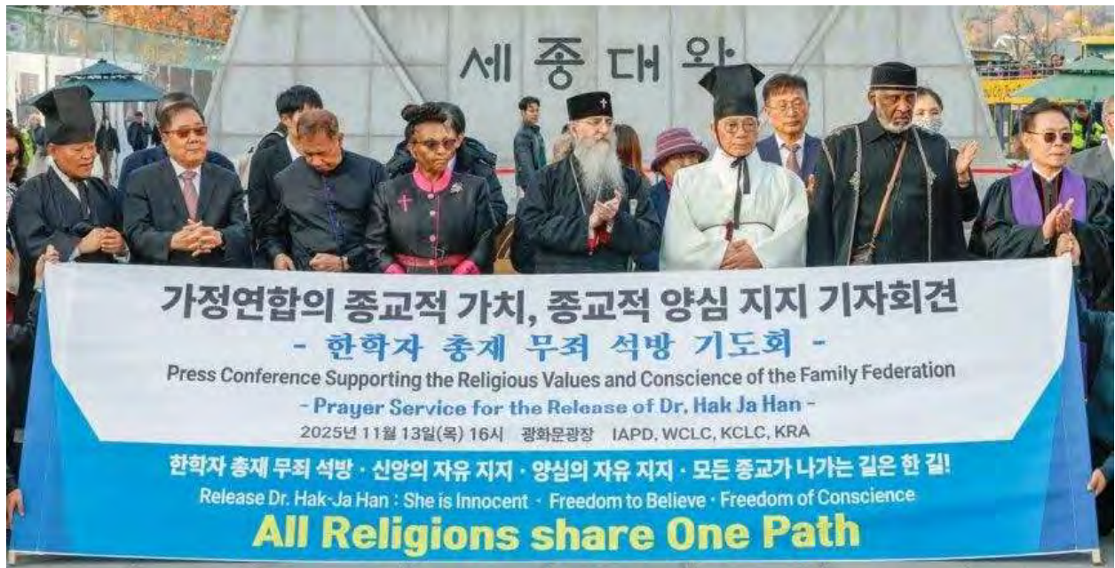
From a rally at King Sejong's Plaza in central Seoul Nov. 13, 2025 led by religious leaders from a wide variety of faiths in support of Mother Han .

And it was the same when Mother spoke two months ago when she was being questioned because it's a clear challenge that people should honor God and not the government of the day first.