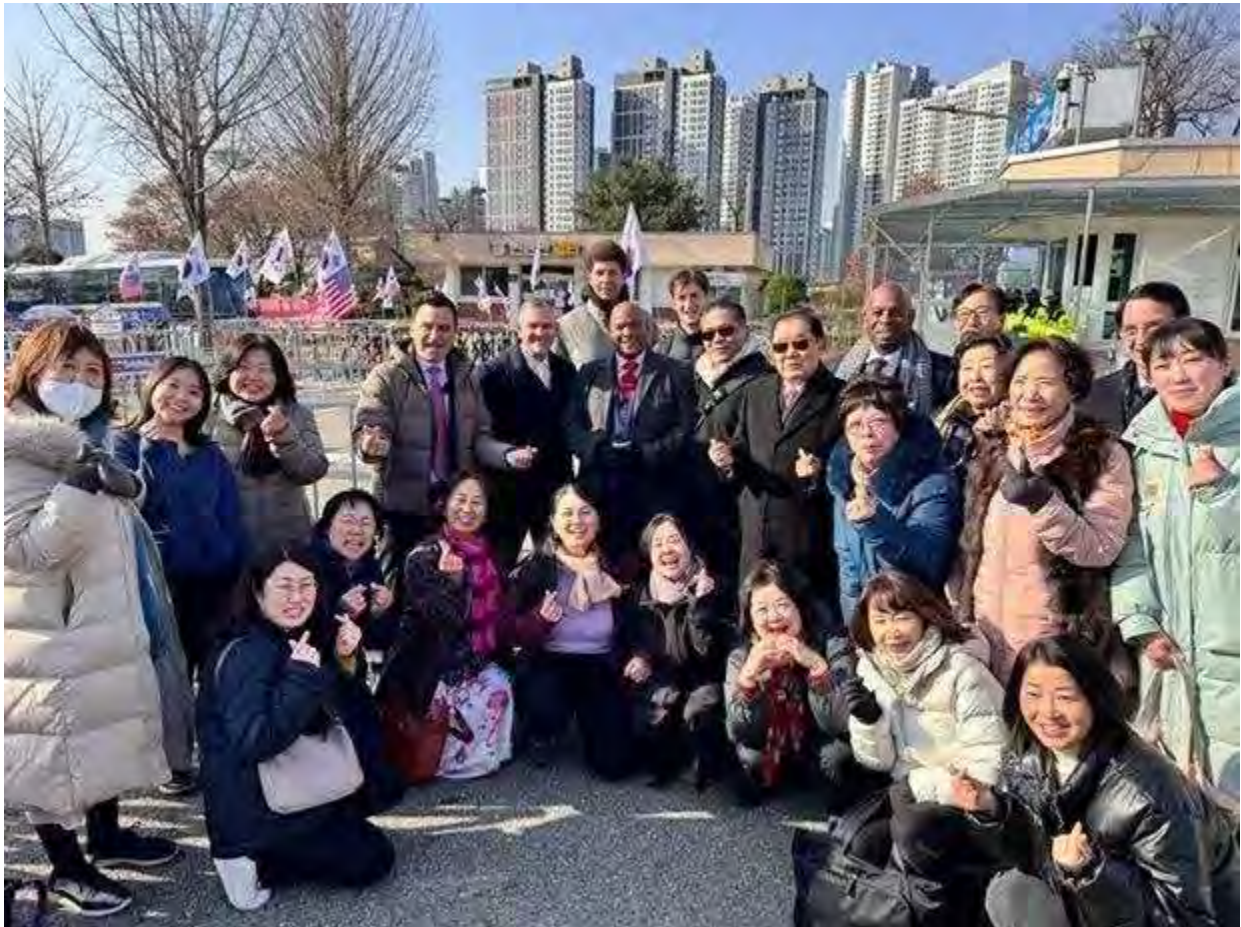
US clergy and Family Federation members from Los Angeles outside Seoul Detention Center December 4, 2025

For this reason, political leaders, religious leaders and scholars around the world know me as the Mother of Peace, as Holy Mother Han .