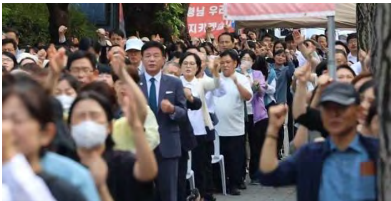
From a prayer meeting in support of Mother Han outside Seoul Detention Center, November 2025

And we don't know how long it will take. We don't know what pressures there might be to deny bail.