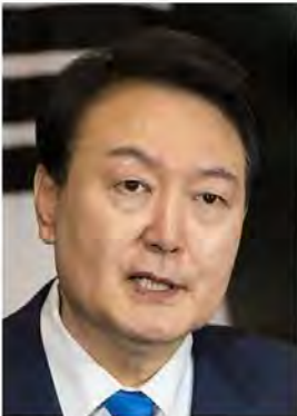
In same detention center as Mother Han : Former President Yoon Suk-yeol of the Republic of Korea April 25, 2023, in Maryland, USA.

"Where did all this money come from? It came from members using their housing funds."