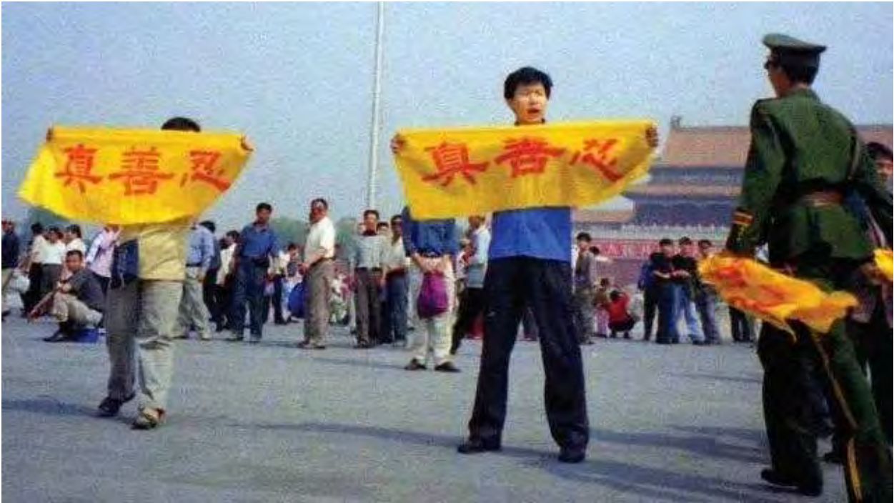
Falun Gong protesters about to be arrested in Tiananmen Square in Beijing in the early phase of the persecution

mosques are ignored. Tibetans suffer a similar fate: monasteries are destroyed, the Tibetan language is suppressed, and the Dalai Lama is defamed as a "separatist". These narratives, spread by state-controlled media, legitimize cultural genocide.