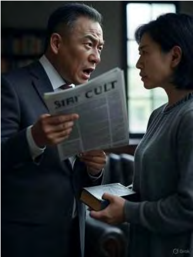
Media as weapon: Angry Chinese man accusing woman after reading about cult in a newspaper. Illustration