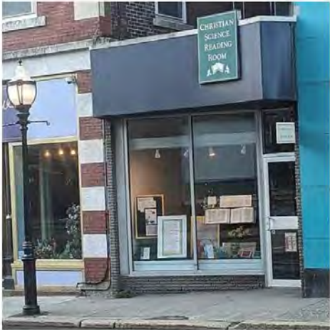
In France, considered a threat to public order: Christian Science. Here, one of their reading rooms, this one located downtown in Brattleboro, Vermont, USA. Photo: Artaxerxes / Wikimedia Commons . License:

Today, MIVILUDES, the state’s anti-cult task force, continues to issue alerts that the media repeat without question, shaping both public sentiment and policy .