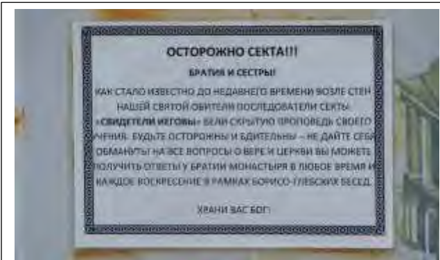
A public warning against the Jehovah's Witnesses in the town of Torzhok in Tver Oblast, Russia in 2012. The headline says "Caution, sect!!!" The text goes on to say, "Brothers and sisters! As became known recently, near the walls of our holy monastery, followers of the sect Jehovah's Witnesses secretly preach their teachings. Be careful and vigilant! Don't let yourself be fooled! You can get answers to all questions about faith and the Church from the brotherhood of the monastery at any time and every Sunday within the framework of Boris-Glebsk conversations."

In Russia, Jehovah's Witnesses were banned as an "extremist organization" in 2017, a move that was prepared by years of state-orchestrated media campaigns. State media outlets such as Rossiya 24 and RT portrayed the group as a threat to national security, despite no evidence of criminal behavior. After the ban, over 180,000 members were forced underground, hundreds were detained, and many reported torture and house searches. State media played a central role in rallying public support for the persecution and suppressing dissent. This case shows how media can be used as a tool of state repression.