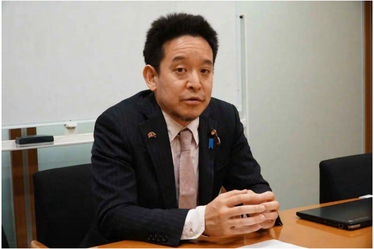
Satoshi Hamada in April 2024

Japanese lawmaker looking for evidence of Kishida administration pressuring council representatives