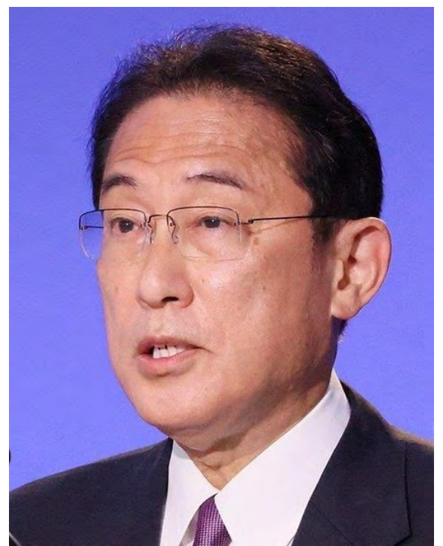
Prime Minister Fumio Kishida delivering a speech at the COP26 in November 2021

Experienced LDP politician claims Prime Minister's attack on religious minority exposes weakness of Kishida