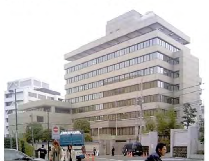
The Japanese headquarters of Chosen Souren (General Association of North Korean Residents in Japan) in Chiyoda, Tokyo, Japan. Photo: GcG / Wikimedia Commons. License: CC Attr 3.0 Unp. Cropped

such a defamatory term despite it originally being reserved for certain groups identified by the National Police Agency, such as "yakuza and pseudoyakuza" and "political extortion groups".