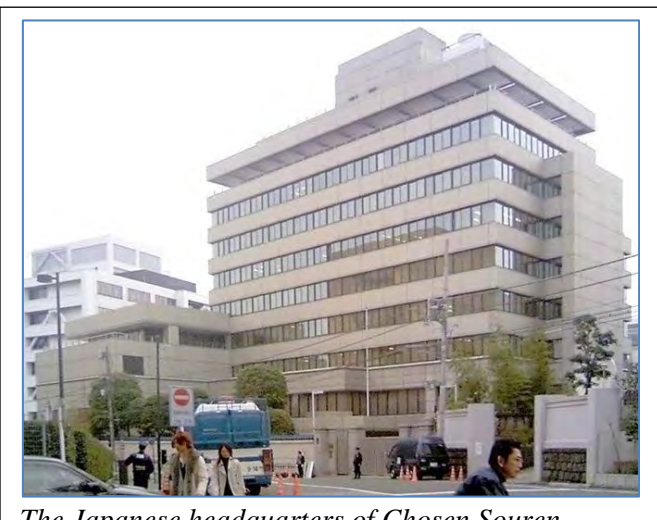
The Japanese headquarters of Chosen Souren (General Association of North Korean Residents in Japan) in Chiyoda, Tokyo, Japan

formerly known as the <u>Unification Church</u>) as an "anti-social" organization. The majority of the media uses such a defamatory term despite it originally being reserved for certain groups identified by the National Police Agency, such as "yakuza and pseudo-yakuza" and "political extortion groups".