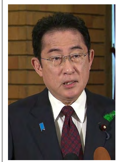
Prime Minister Fumio Kishida swayed by communist campaign. Here, 16th April 2023

Subsequently, Kishida's large party amended its governance code, articulating a policy of "completely cutting off connections with <u>FFWPU</u> and its affiliated organisations". According to Chief Cabinet Secretary Hirokazu Matsuno's statement in the Diet, the term "affiliated organisations" encompasses International Federation for Victory Over Communism (IFVOC).