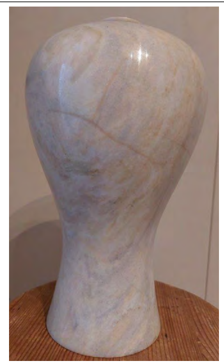
Marble vase, similar to some of those that Unification Church members sold in Japan

the actual situation, I have assisted in settling some such disputes."