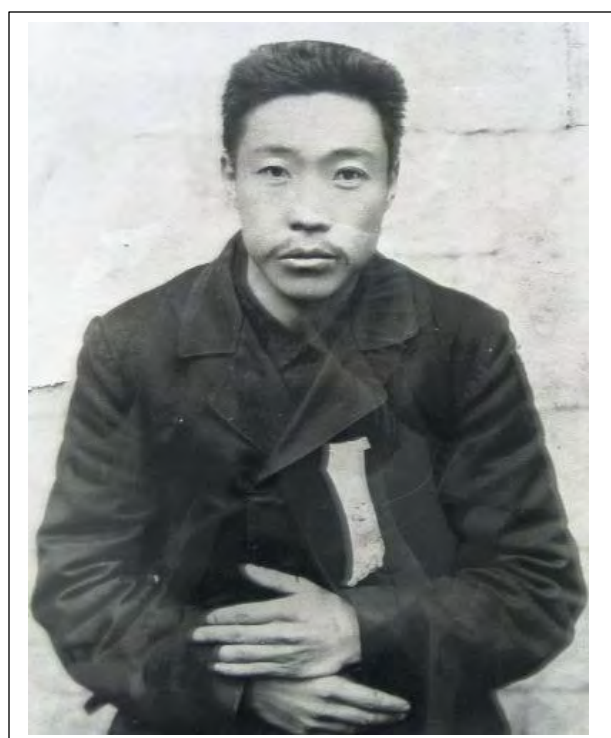
Terrorist in Japan, hero for Koreans: An Junggeun, Korean independence activist who assassinated the Japanese prime minster in Harbin, China in 1909

"The realization that a former prime minister could be a target of an 'assassination' and the awareness of Abe's significant political influence struck me simultaneously. A few days later, the 'confession' of the shooting suspect, Tetsuya Yamagami, was leaked to the media, and it was reported that Yamagami's crime was motivated by 'resentment towards the former <u>Unification Church</u>'.