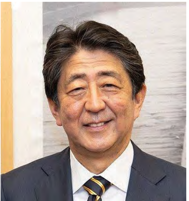
Just months before assassination: Japan's Prime Minister Shinzo Abe in March 2022