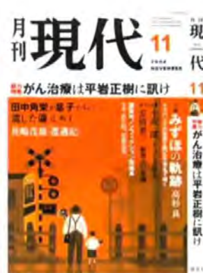
Front cover page of Monthly Gendai Nov. 2004

Kazuhiro Yonemoto (米本和弘) titled "The Untold Story of the Horror and Tragedy of Religious Confinement" (書かれざる宗教監禁の恐怖と悲劇).