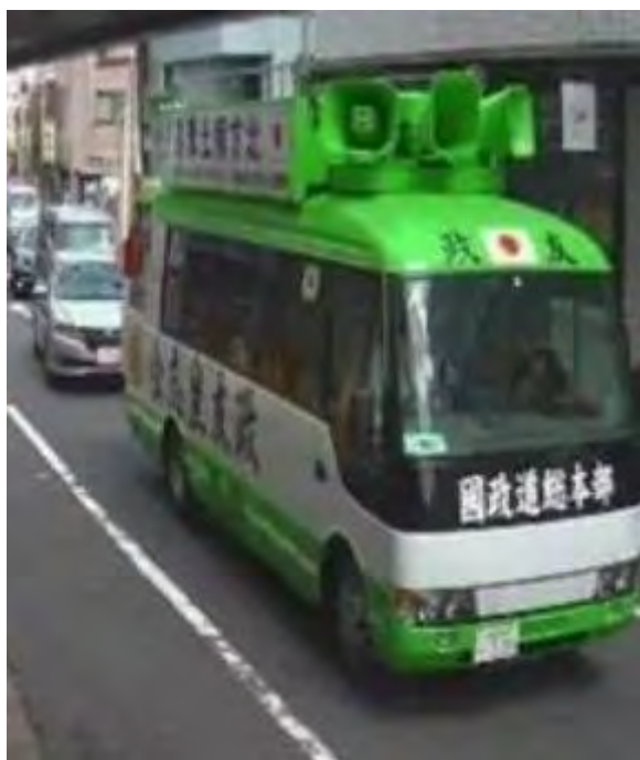
Loudspeaker van of the kind used to blast hostile messages outside Family Federation premises in Japan

members to sever ties with IFVOC, stated, "It is a serious infringement on freedom of thought and action," and emphasized that it was a manifestation of the Communist Party's dictatorial policies. He asserted, "Statements that violate the Constitution by infringing on freedom of thought and action should be refrained from." If Prime Minister Kishida had similarly announced such a reasonable stance, there would have been no issue. Moreover, such a situation would not have escalated to the extreme measure of filing a dissolution request against our church .