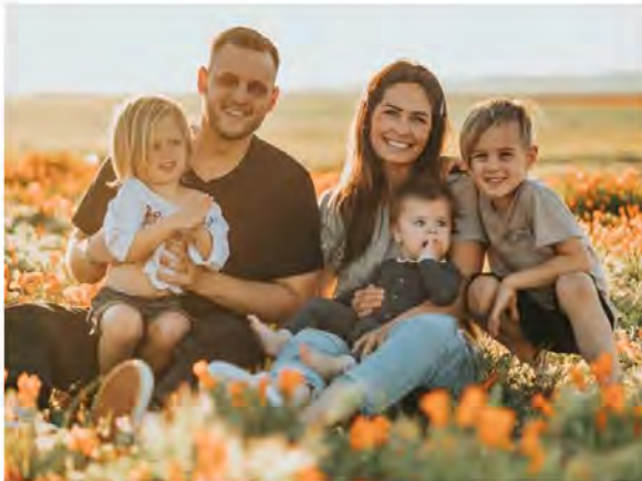
The family is important for the Family Federation.

“We are a religious corporation that celebrates its 64th anniversary this year. There are about 100,000 active believers throughout Japan. They are ordinary Japanese citizens who pray sincerely in the morning and evening, go to church on Sundays to worship, study the Bible and the Unification Principles , our doctrine, work as members of society on weekdays, and socialize with their neighbors.