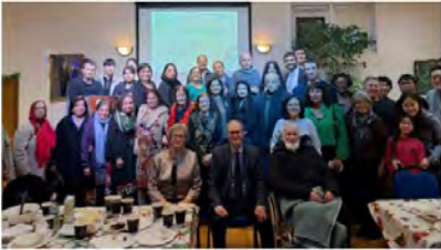
WFP UK -Christmas Celebration event 2023