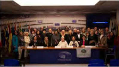
WFP Italy - WOMEN OF FAITH AND THEIR...