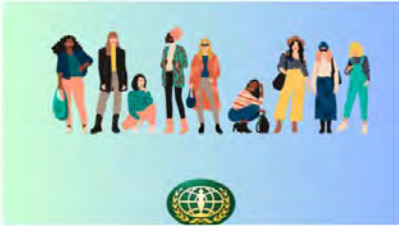
WFP Denmark/Sweden - Invest in women: Acceletat...