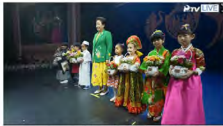
International Kids with True Mother