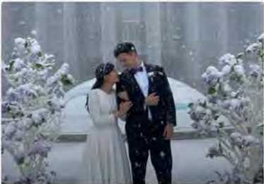
Newly Blessed Couple testifies to