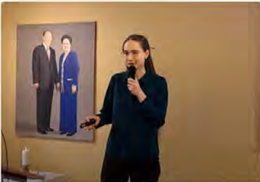
Newly Blessed Couple testifies to