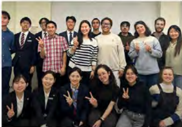
EMPOWER x UPA Cadets in Tirana,