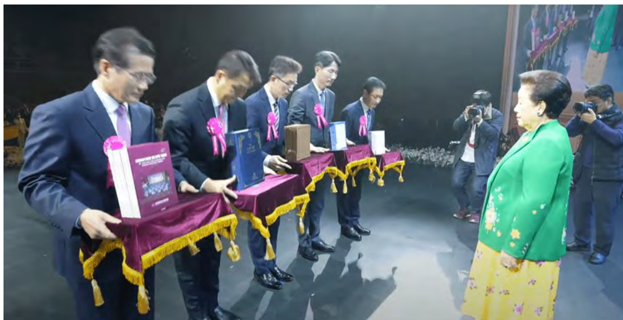
New publications in Korean being presented to Mother Moon on her birthday 15th Feb. 2024