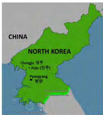
North Korea.

Dr. Hak Ja Han was born on 10 th February 1943 (6th day of the first month according to the Oriental lunar calendar) in the village of Shineui in the district of Anju in present day North Korea. Her parents were committed Christians. She became an only child because her parents were separated due to political unrest.