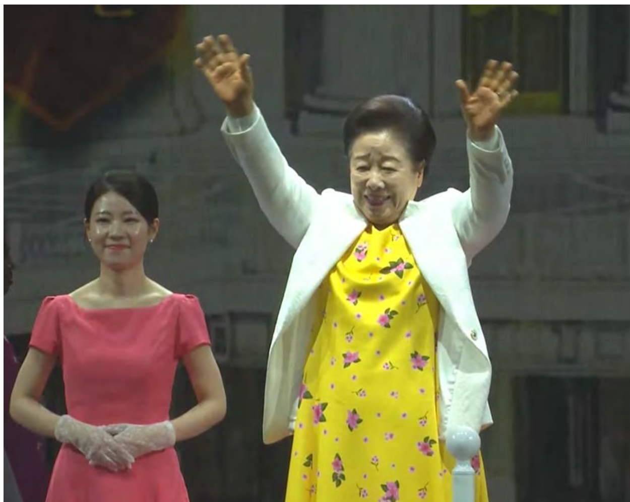
Mother Moon at the Marriage Blessing ceremony in South Korea 15th February 2024