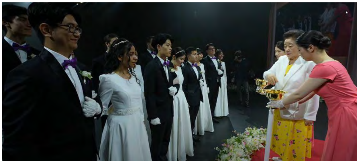
Mother Moon sprinkling holy water on representative couples 15th Feb. 2024

The first part of the ceremony after Mother Moon had entered the stage through two lines of attendants, was the sprinkling of holy water on all the couples. Representative couples were on stage in two lines in front of Hak Ja Han . Attendants sprinkled the water on the other couples. Mother Moon then read the Affirmation of the Blessing Vow, to which everyone shouted a loud yes. Essentially, they promised to do all they could to be a loving and responsible spouse, establish a harmonious family, that would strive to build the kind of world that God originally envisioned, an ideal world where the family is the cornerstone.