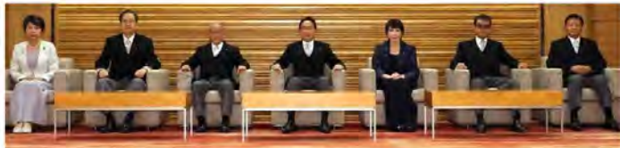
Some of Fumio Kishida's administration, 13 th Sep. 2023.

Extreme China-inspired leftwingers rejoicing as Kishida administration introduces laws for mass deprogramming tens of thousands with "wrong views"