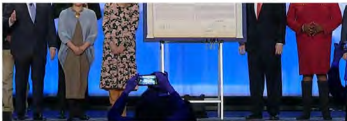
Some of the speakers at the special luncheon on 31st Jan. 2024 at the International Religious Freedom Summit in Washington DC.

Extract from a special pre-recorded message presented 31 st January at the International Religious Freedom Summit 2024 in Washington DC, by senior American politician Newt Gingrich, former Speaker of the US House of Representatives. He delivered his presentation during a conference luncheon sponsored by The Washington Times Foundation and the Universal Peace Federation on the last day of the summit.