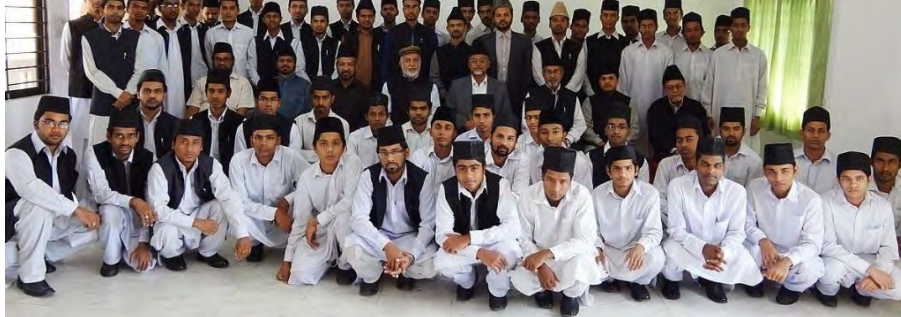
Students and teachers at Ahmadiyya institute in Bangladesh in 2011. Photo: Lrtaher / Wikimedia Commons. License: CC ASA 4.0 Int . Cropped

Johnson Cook and Swett describe how the Indian government has supported “policies that discriminate against and hinder the freedom of religious minorities, such as Christians, Muslims, Sikhs, and Hindu Dalit communities.” Those policies have caused violent mob attacks against minority religions.