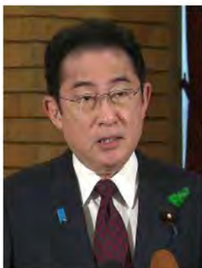
Prime Minister Fumio Kishida swayed by communist campaign. Here, 16th April 2023.

But the political pressures and the dishonesty of the Communist Party of Japan and the dishonesty of the lawyers who made a living out of some 20 years of attacking the Unification Church , and then the Family Federation , all of those risk overriding the rule of law.