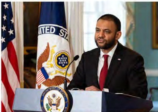
Rashad Hussain 15th May 2023.

ambassador Rashad Hussein, the IRF ambassador at large, to continue the good attention he's already given this issue to alert Secretary of State Anthony Blinken and to shine a very bright light on Japan.