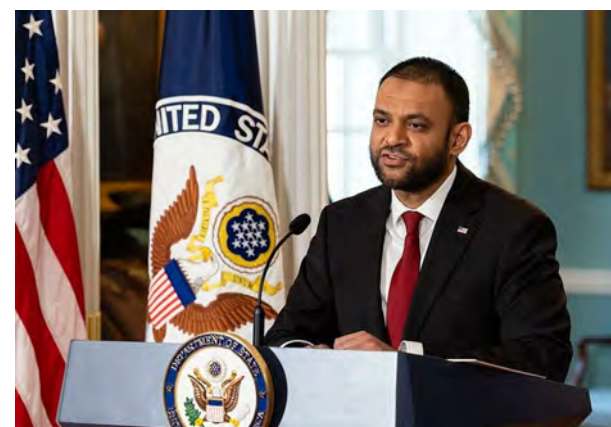
Rashad Hussain 15th May 2023. Photo: Chuck Kennedy / U.S. Department of State / Wikimedia Commons. Public domain image. Cropped