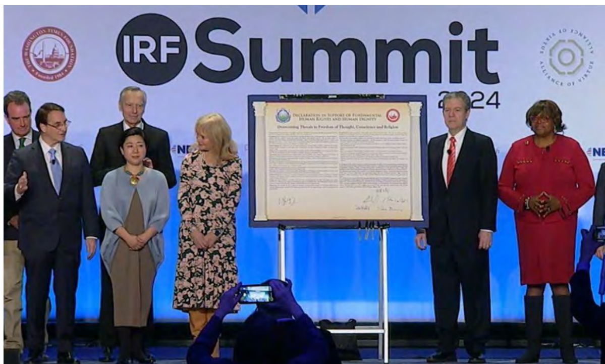
Some of the speakers at the special luncheon on 31st Jan. 2024 at the International Religious Freedom Summit in Washington DC

Former House Speaker shocked by Kishida administration being swayed by decades long vicious communist campaign