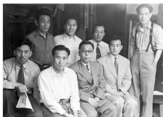
Sun Myung Moon with early followers in 1954

The movement began to be called the "Unification Church", which is far easier to say than the original long name. Sun Myung Moon himself also began to use this name, although he