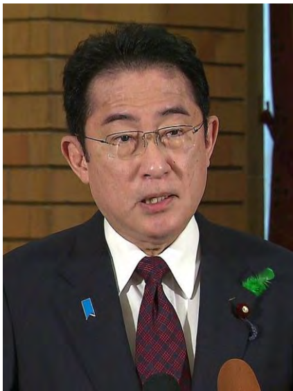
Prime Minister Fumio Kishida swayed by communist campaign. Here, 16th April 2023

But the political pressures and the dishonesty of the Communist Party of Japan and the dishonesty of the lawyers who made a living out of some 20 years of attacking the Unification Church , and then the Family Federation , all of those risk overriding the rule of law.