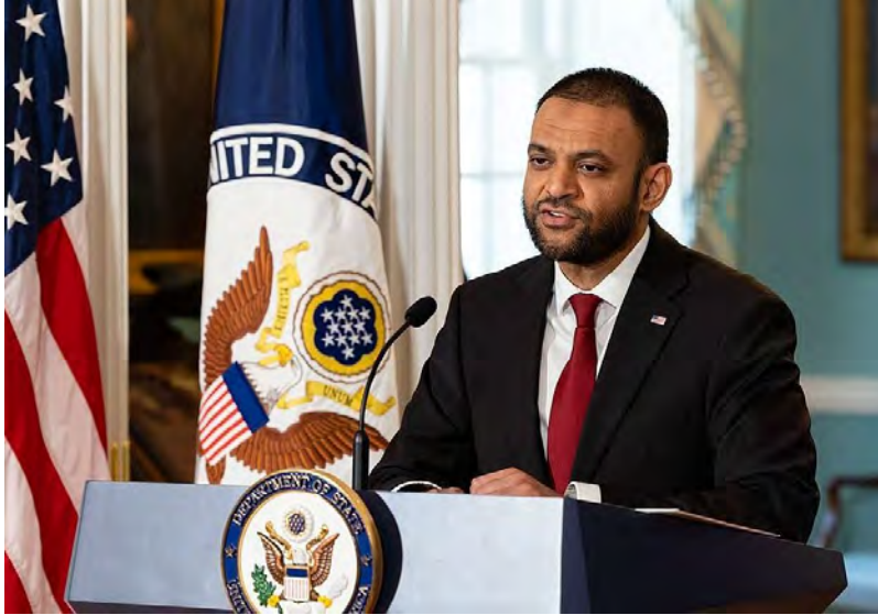
Rashad Hussain 15th May 2023

We have to make sure that the Japanese government understands that this is a key test of the future of Japan, a key test of the future of religious liberty.