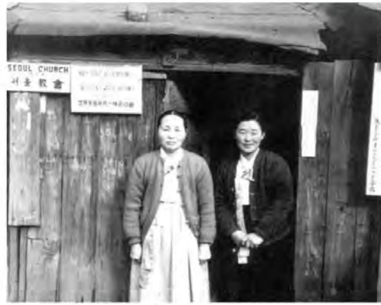
First meeting place in Seoul

However, the Unification Church was discontinued in 1997. Then Father Moon declared that it had served its purpose. He claimed that the age of the different religions was over, and that we therefore no longer needed a