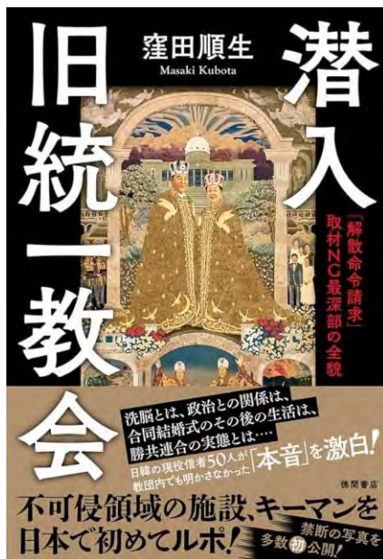
The front cover of 'Infiltrating the Former Unification Church - Tankobon Softcover, Nov. 2023), by Masaki Kubota

More about media relationship: Horrendous Persecution in Japan