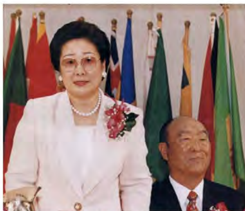
Mother and Father Moon 31st July 1996

The chronicle "40 Years in America" describes the event,