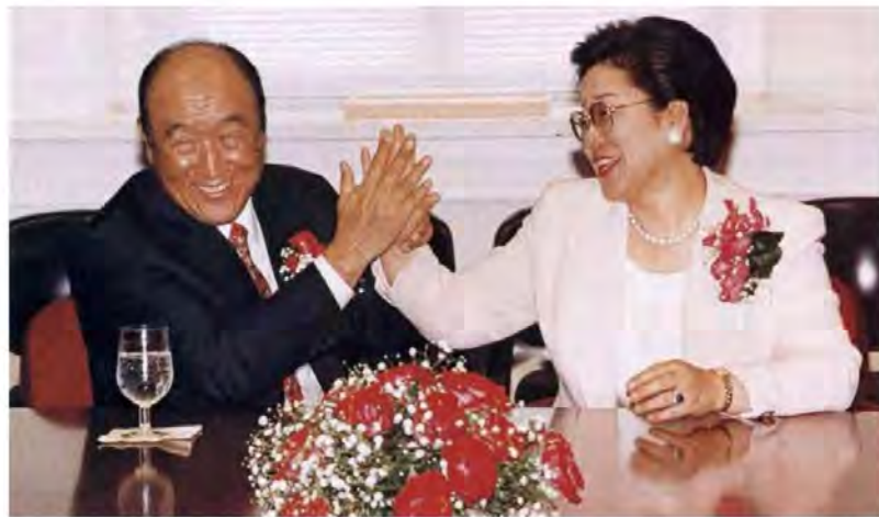
Father and Mother Moon 1st August 1996.

The Family Federation for World Peace and Unification is a global federation of individuals and families who aim to create a world of peace and unity beyond national, cultural, religious and ideological barriers, a world where everyone may live together in peace and harmony.