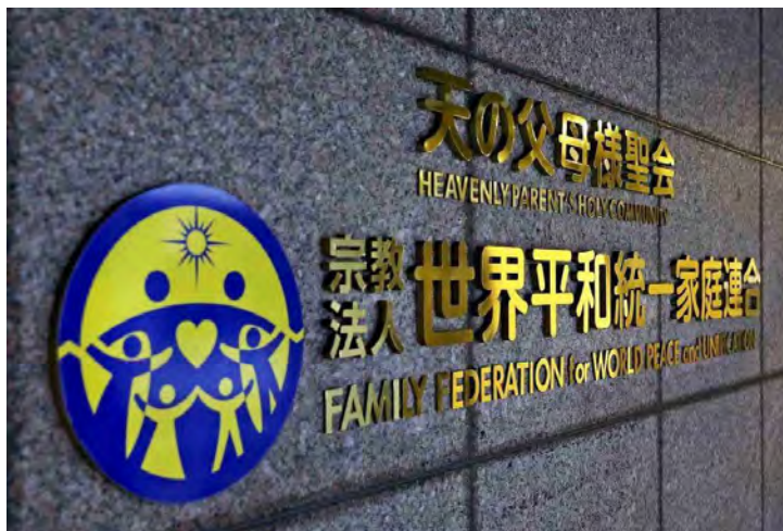
Sign at the entrance of the headquarters of the Family Federation of Japan in Shibuya, Tokyo

- Did your "undercover interviews" make you think that the former Unification Church was a religious organisation that ought to be dissolved?