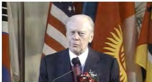
Gerald Ford 31st July 1996

Gerald Ford, U.S. President 1974-1977, spoke at the inauguration 31 st July 1996. He said,