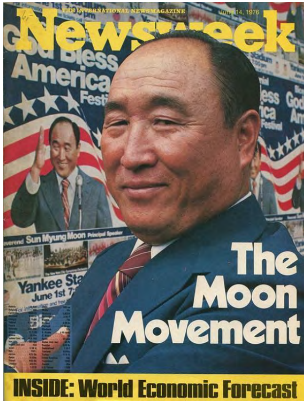
front cover of Newsweek 14th June 1976