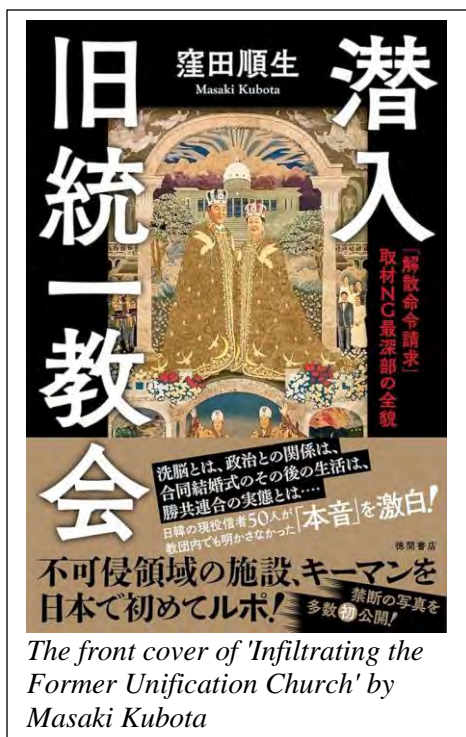
The front cover of 'Infiltrating the Former Unification Church' by Masaki Kubota

I thought that some people might spread stories that would discredit my credibility in the media or tell them, "Don't use that person!"