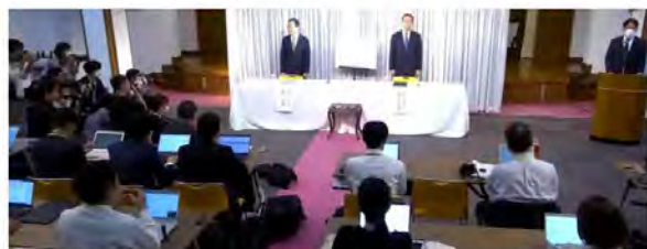
From the press conference in Tokyo 7th Nov. 2023.

Tanaka also commented on the effect of a wave of media disinformation where the Family Federation is somewhat held responsible for the assassination of Shinzo Abe in July 2022,