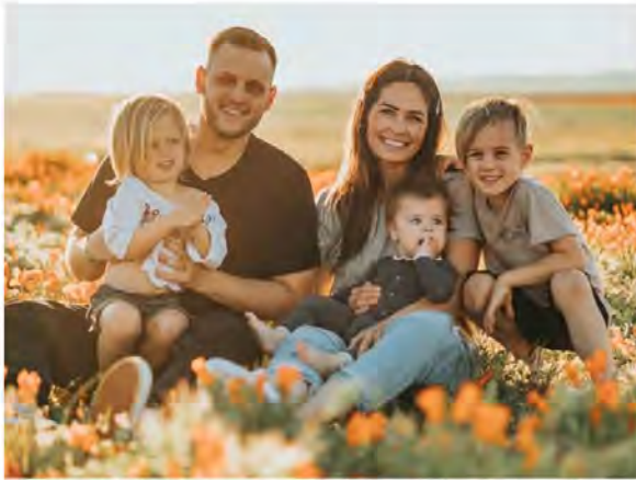
The family is important for the Family Federation.

“We are a religious corporation that celebrates its 64th anniversary this year. There are about 100,000 active believers throughout Japan. They are ordinary Japanese citizens who pray sincerely in the morning and evening, go to church on Sundays to worship, study the Bible and the Unification Principles , our doctrine, work as members of society on weekdays, and socialize with their neighbors.