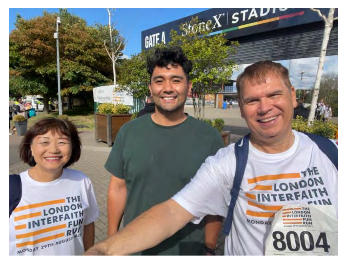
Update - 30/11/2022