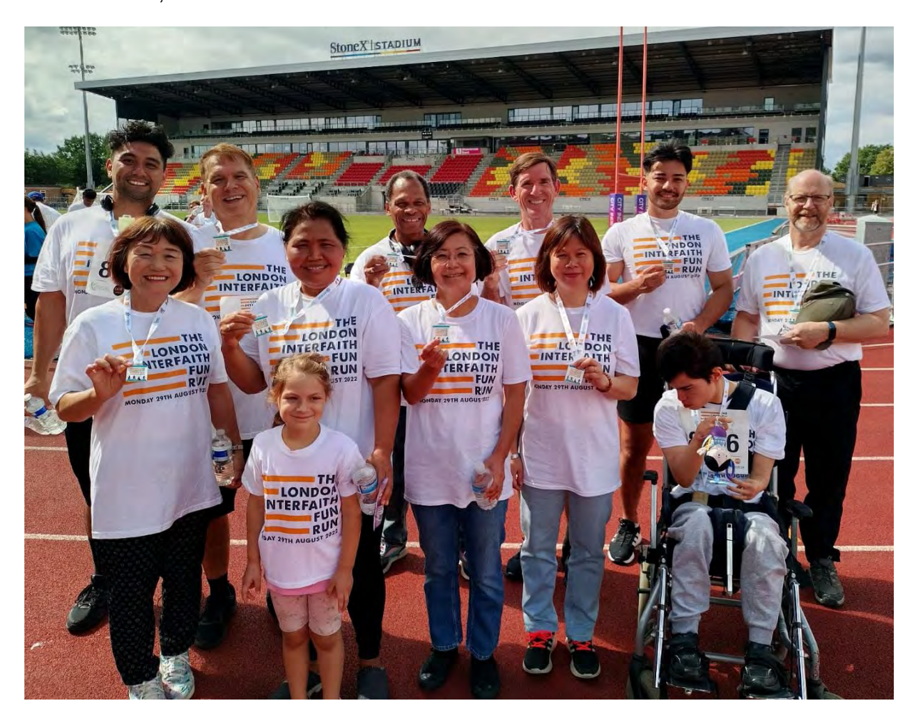
FFWPU-UK was well represented at the recent London Interfaith Fun Run that was held over Bank Holiday Monday as family and friends joined together to fundraise for important causes.