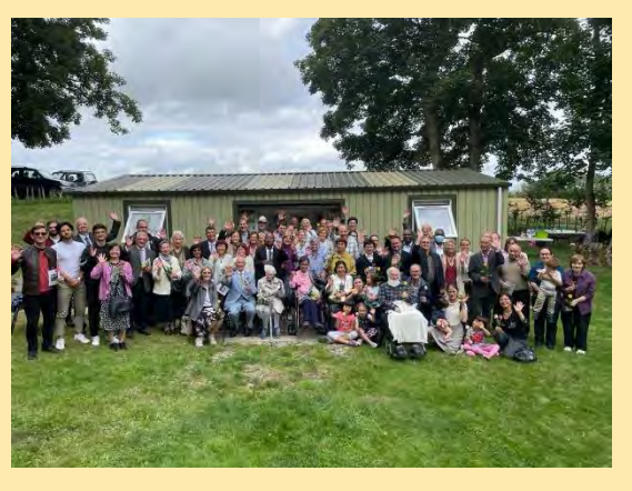
Annual Memorial Service 2021