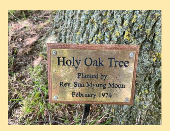
Holy Oak Tree - planted February 1974