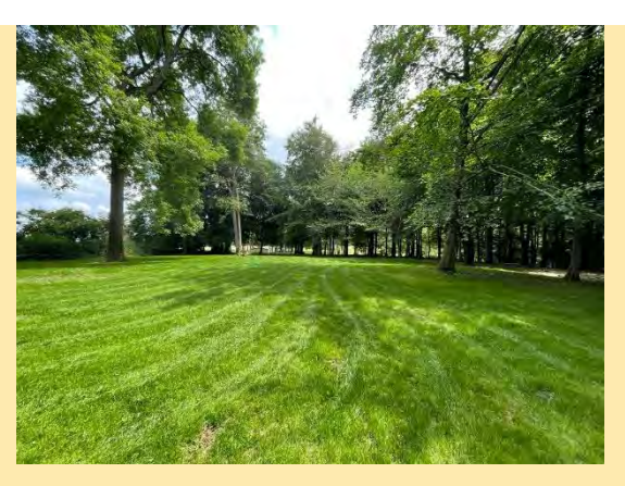
The new Woodland meadow landscaped by Keiko