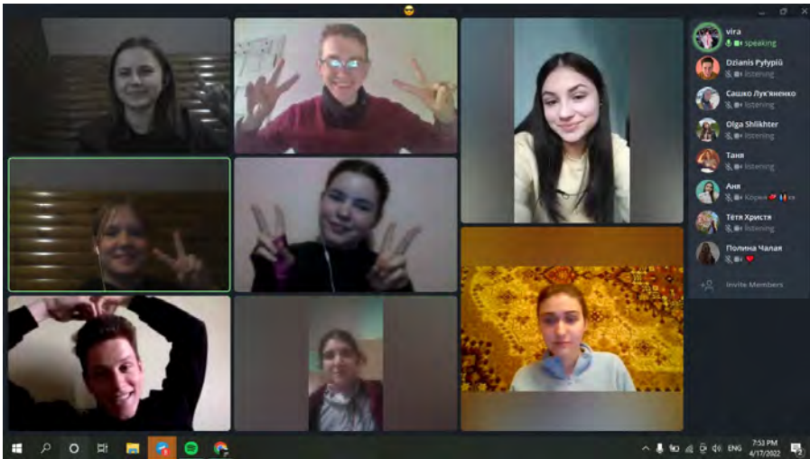
Ongoing online Principle programmes