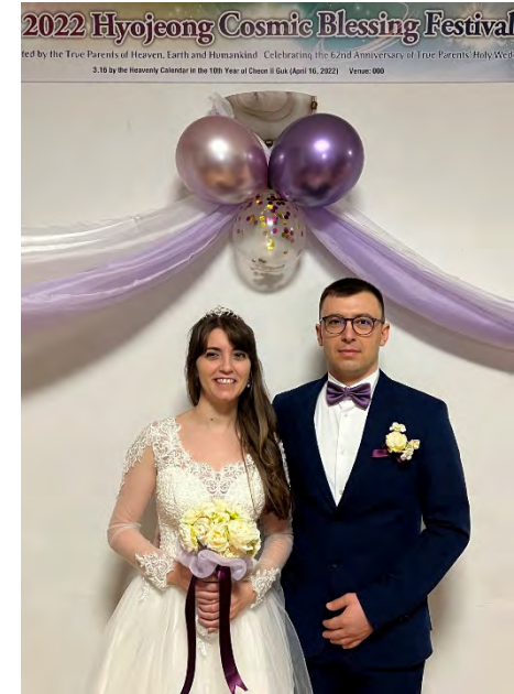
Romania CARP has continued witnessing programmes and Open Hoon Dok Hwe events, and on April 16 th a young married couple participated in the Blessing.