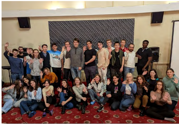
Moscow CARP Open Mike programme