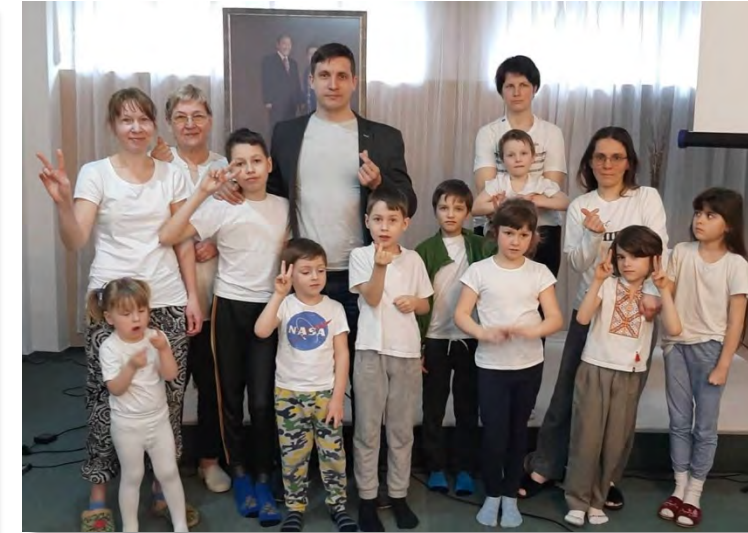
Ukrainian families at SGW in Warsaw