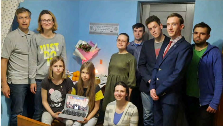
Displaced members in western Ukraine participate in the Holy Days.