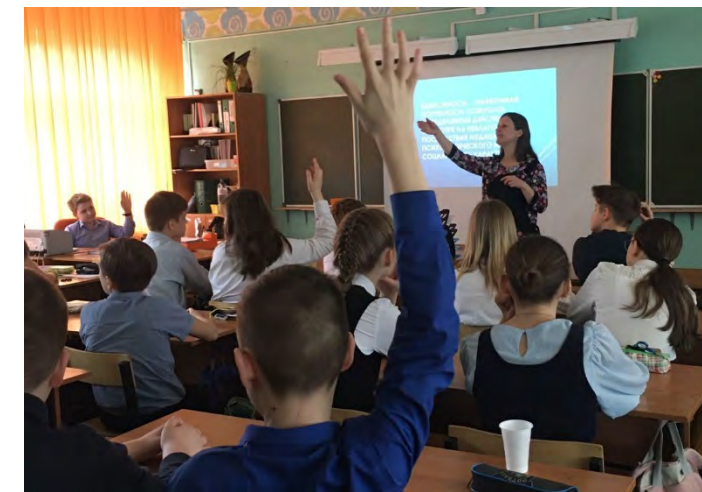
WFP moral education programme