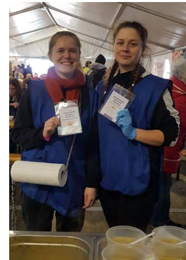
Helping fellow refugees and attending a rally in Warsaw