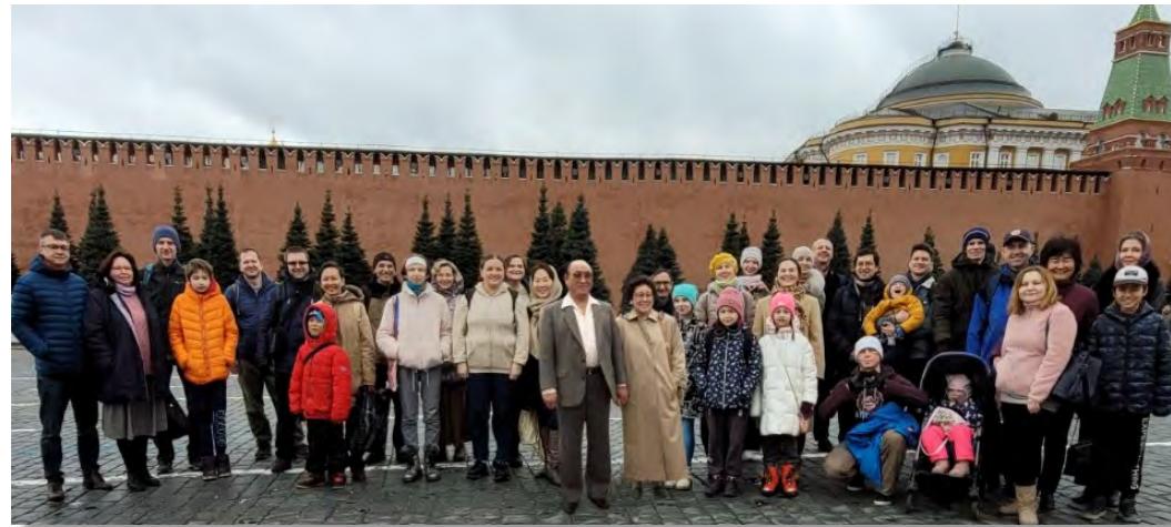
Remembering True Parents' 1990 visit to Moscow