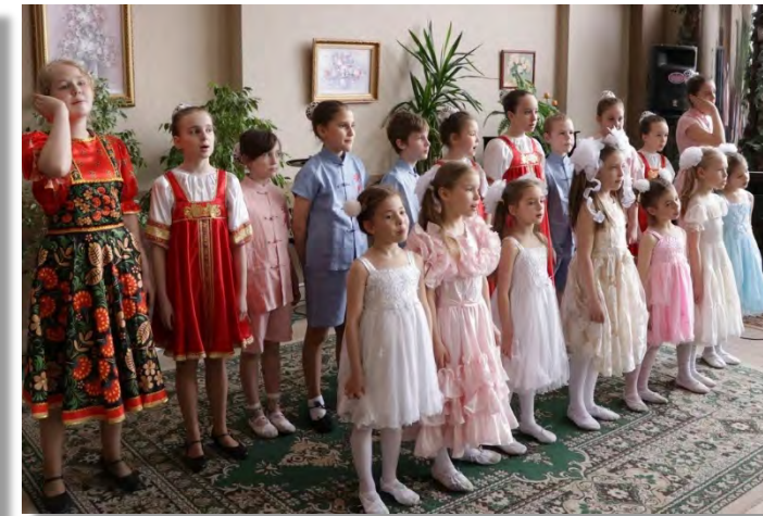
Angels of Peace singing for elderly