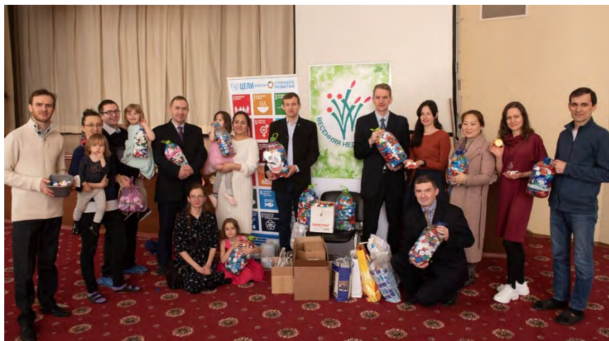
UPF Moscow "Caps" service project