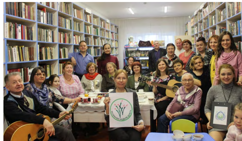
UPF-WFP service project in Ryazan city