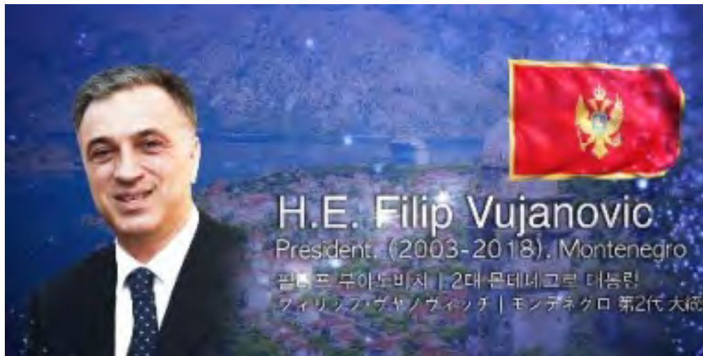
Former President Filip Vujanovic, Montenegro