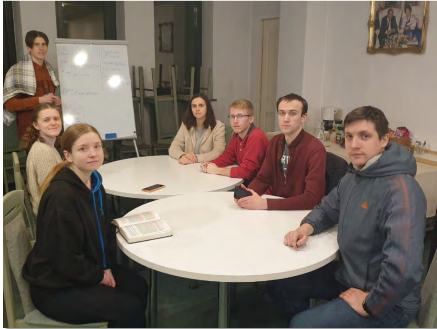
Young Ukrainian members in the Warsaw Peace Embassy after relocating to Poland