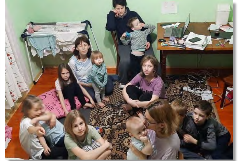
Ukrainian families finding refuge in western Ukraine near the city of Lviv