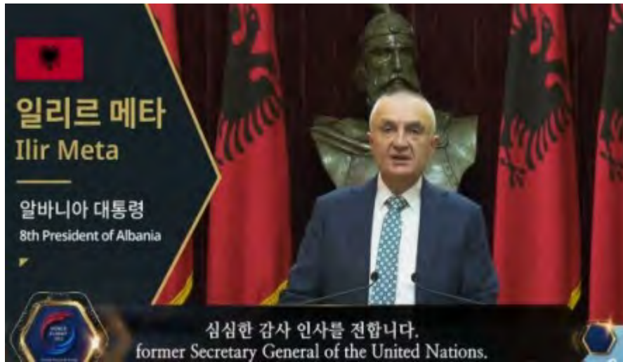
President Ilir Meta, Albania