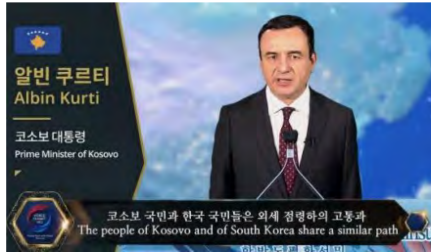
Prime Minister Albin Kurti, Kosovo