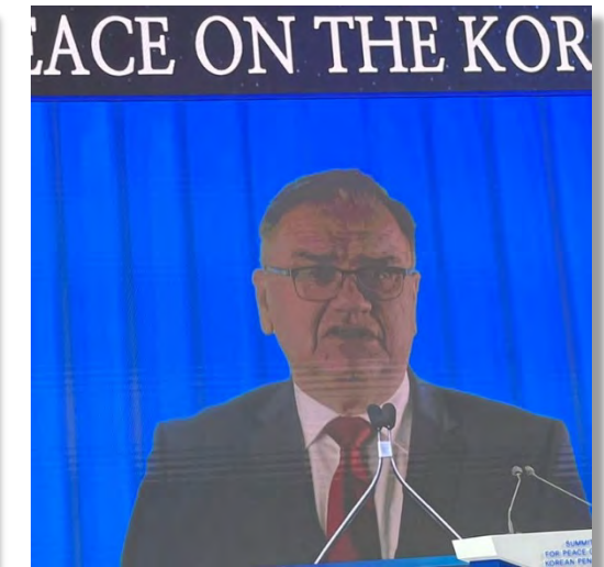
Former Pres. Ivanic of B&H