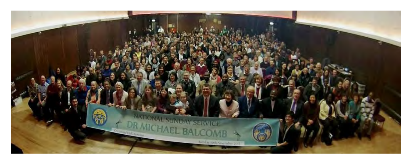
Sunday 28th November at 11am Gladesmore Community School, Crowland Road, Tottenham, London, N15 6EB