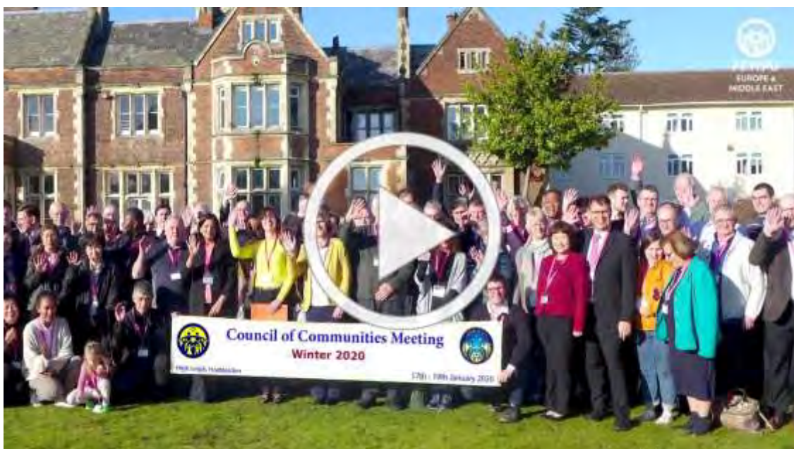
EUME Video News: Council of Communities Meeting - Winter 2020

However, we left with a feeling that it will be anything but "business as usual".