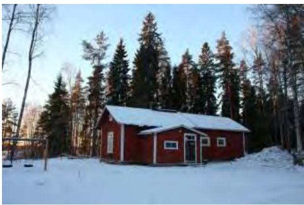
The workshop site in Finland.

We are so excited to invite you all to the annual Nordic Winter Workshop that will be held in the beautiful, white and wintery Finland!