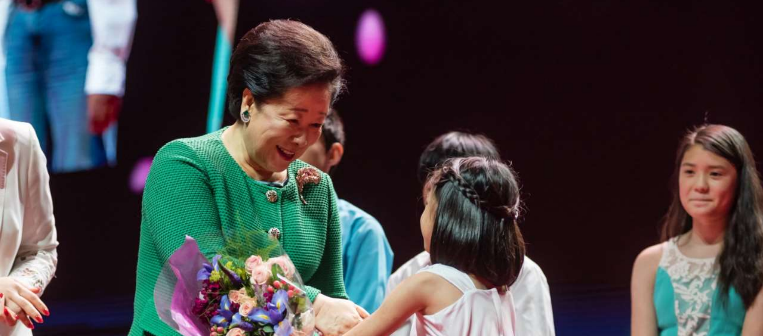
Flower Offering by Children