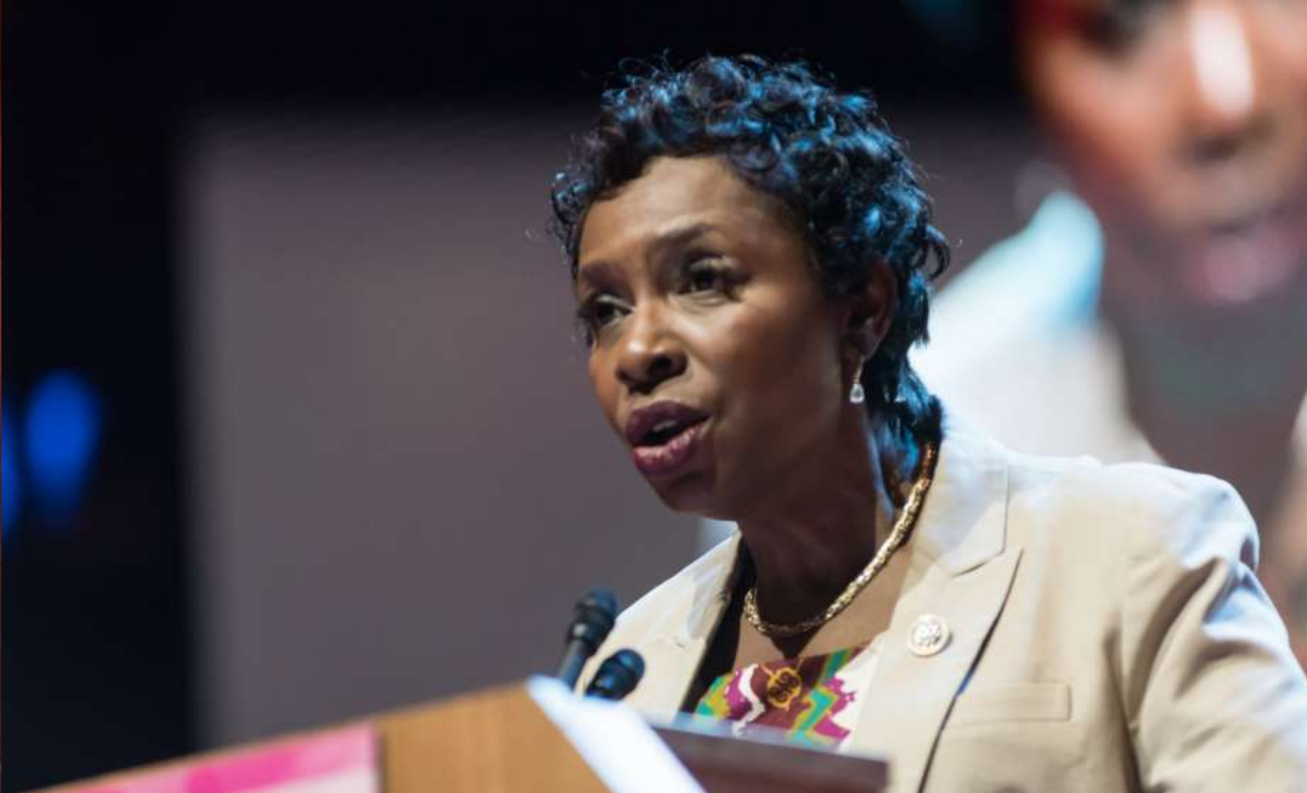
Rep. Yvette Clark – U.S. 9 th District