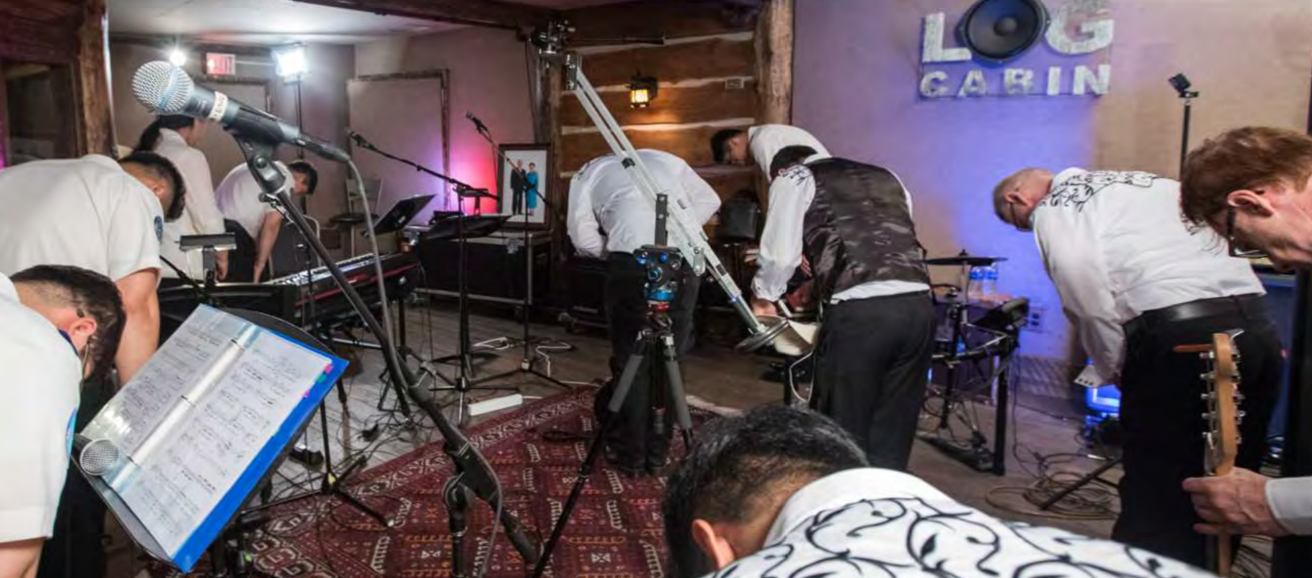
United with True Parents - Studio 4