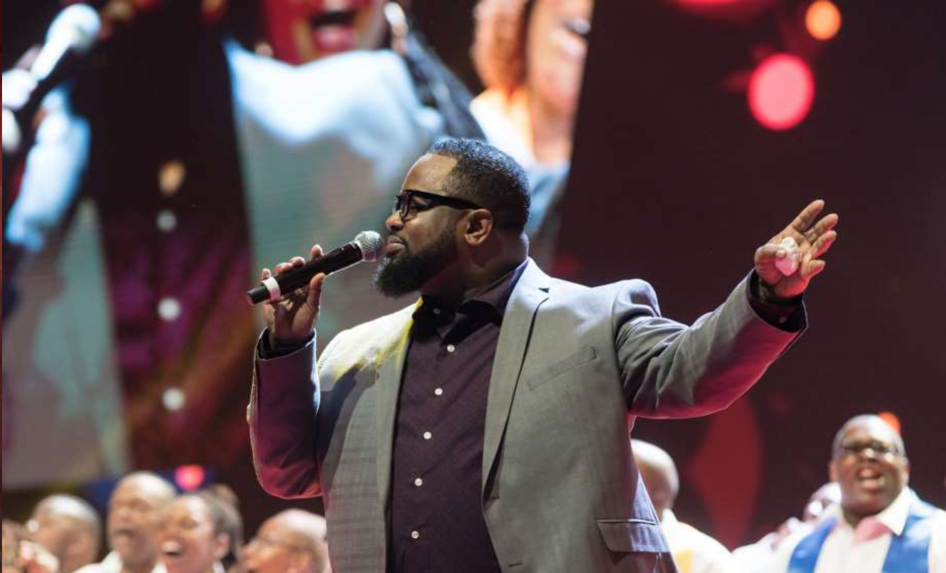
Bishop Hezekiah Walker