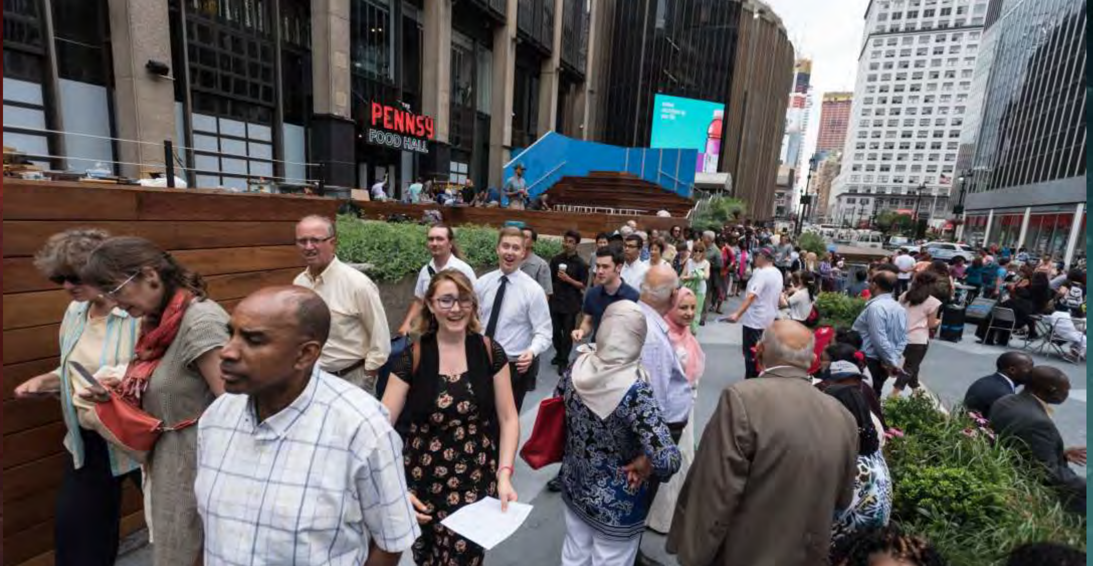
Excited People Waiting Outside