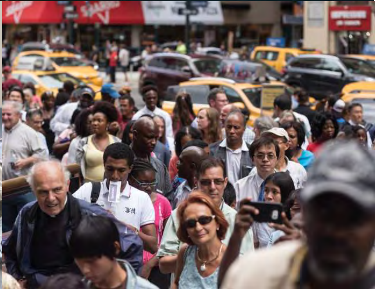
Excited People Waiting Outside