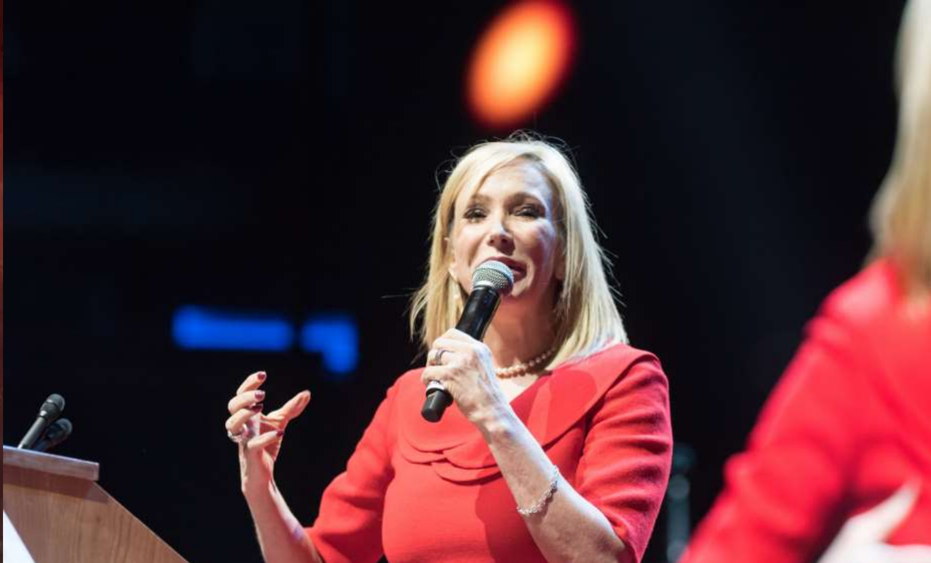
Rev. Paula White-Cain