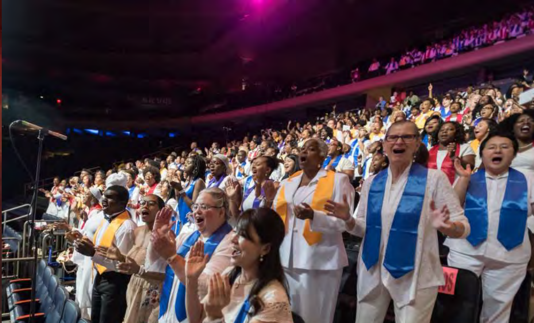
3,000 Voice Choir