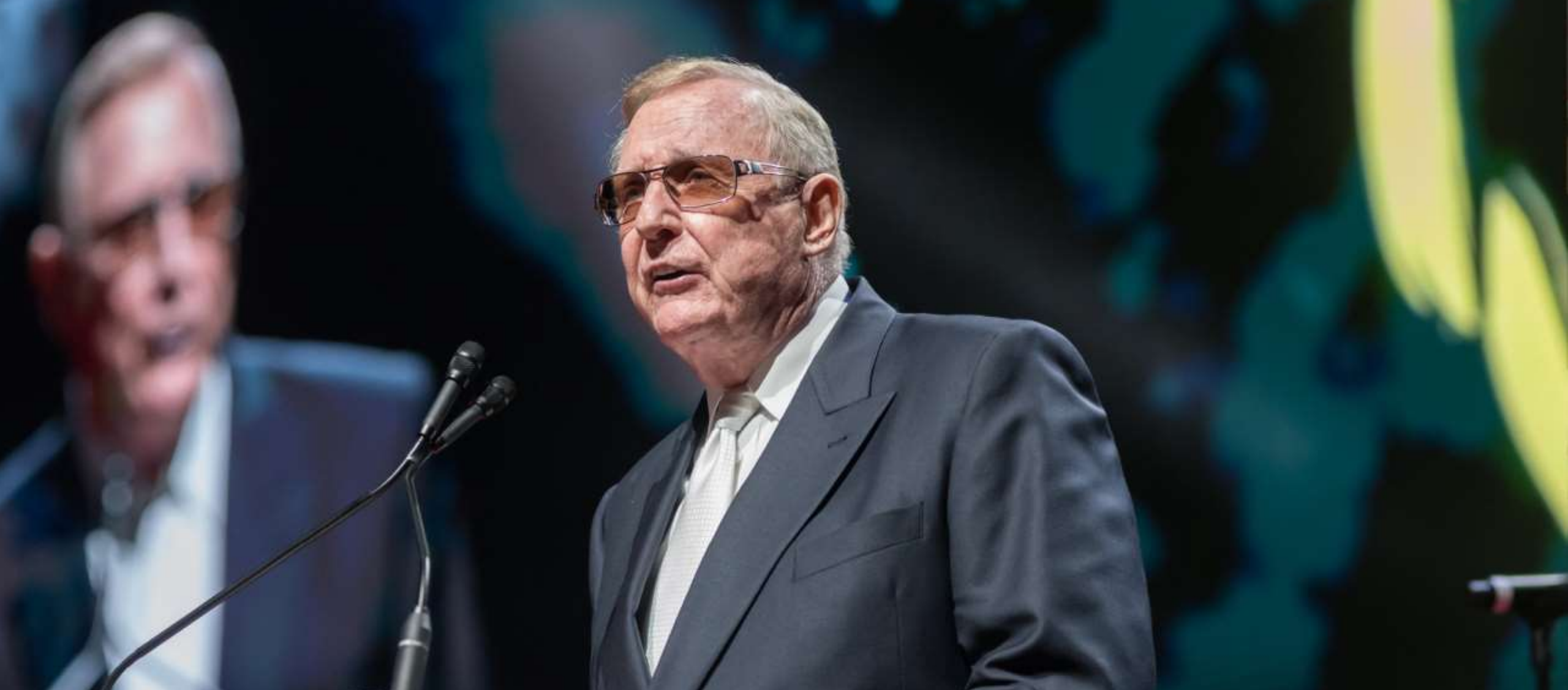
Congressman Dan Burton