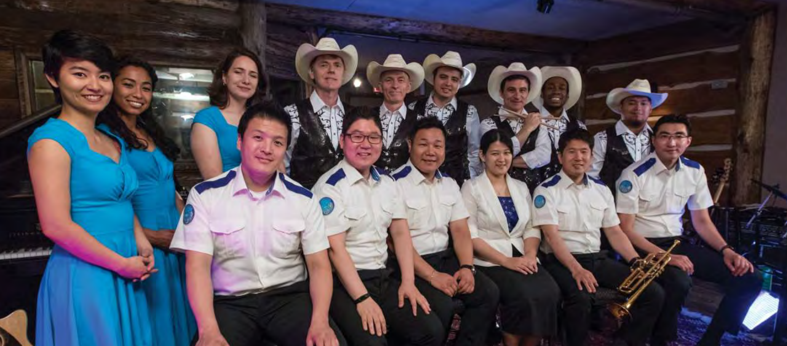
Apple Heaven United – Korea & USA