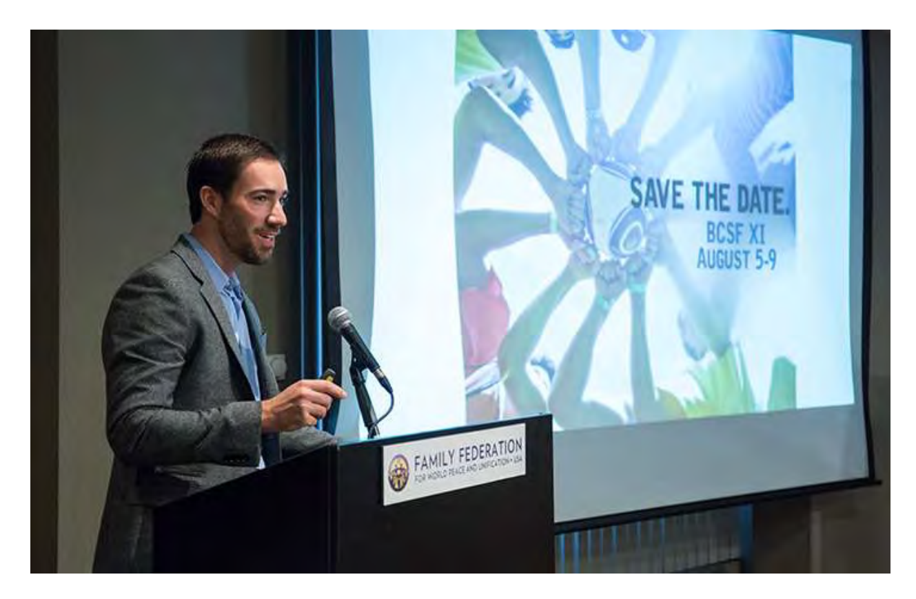
Collegiate Association for the Research of Principles