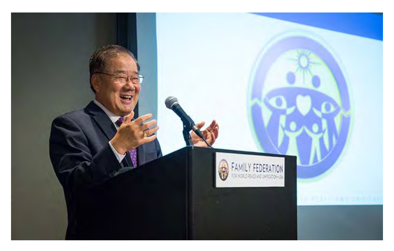
Top Gun Leaders' Workshop