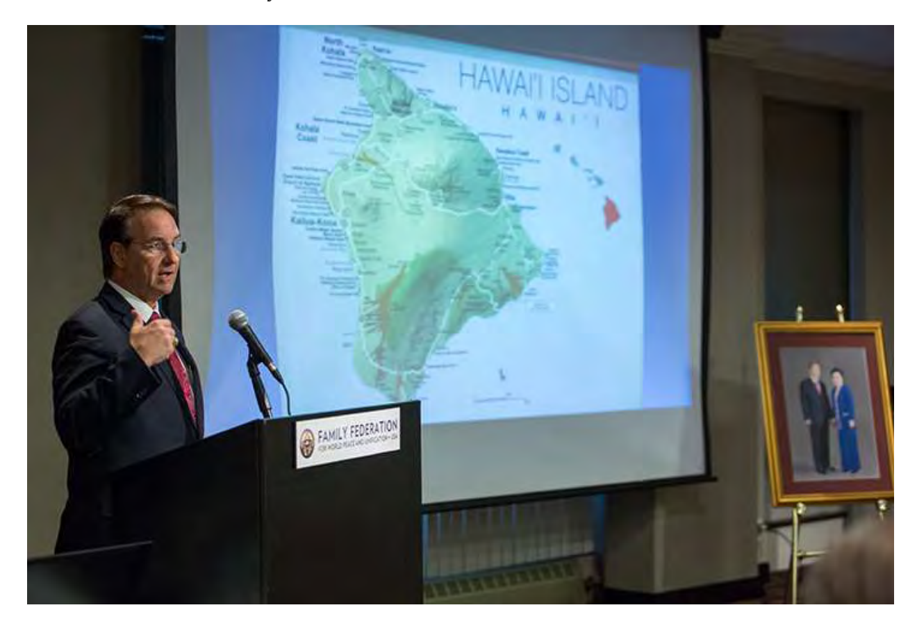
Third Anniversary of True Father's Seonghwa

shared about the first Sunhak Peace Prize press conference and banquet in Washington, D.C., which celebrated two awardees this year.